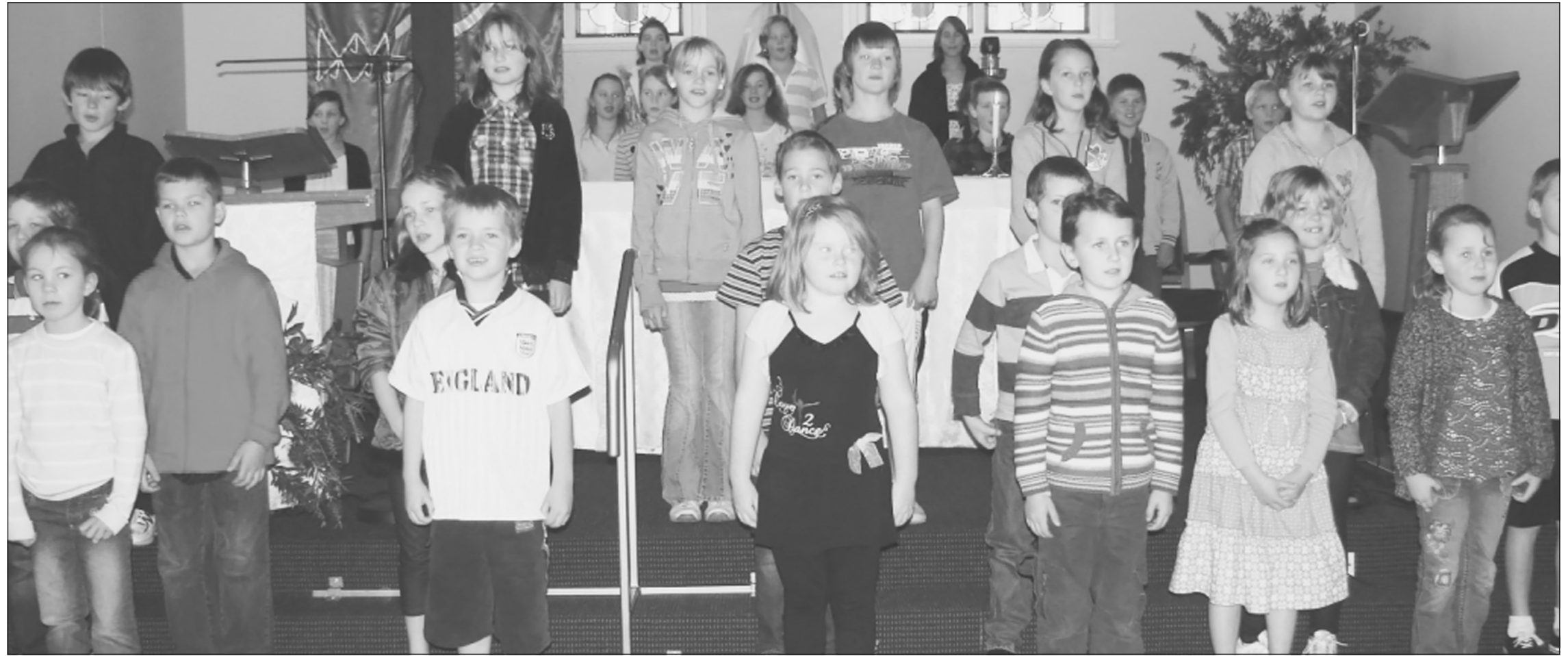
St Patrick's Students dance during the Mass in celebration of Mark MacKillop's canonisation.

By 1899 polo clubs had been formed at Spring Creek and