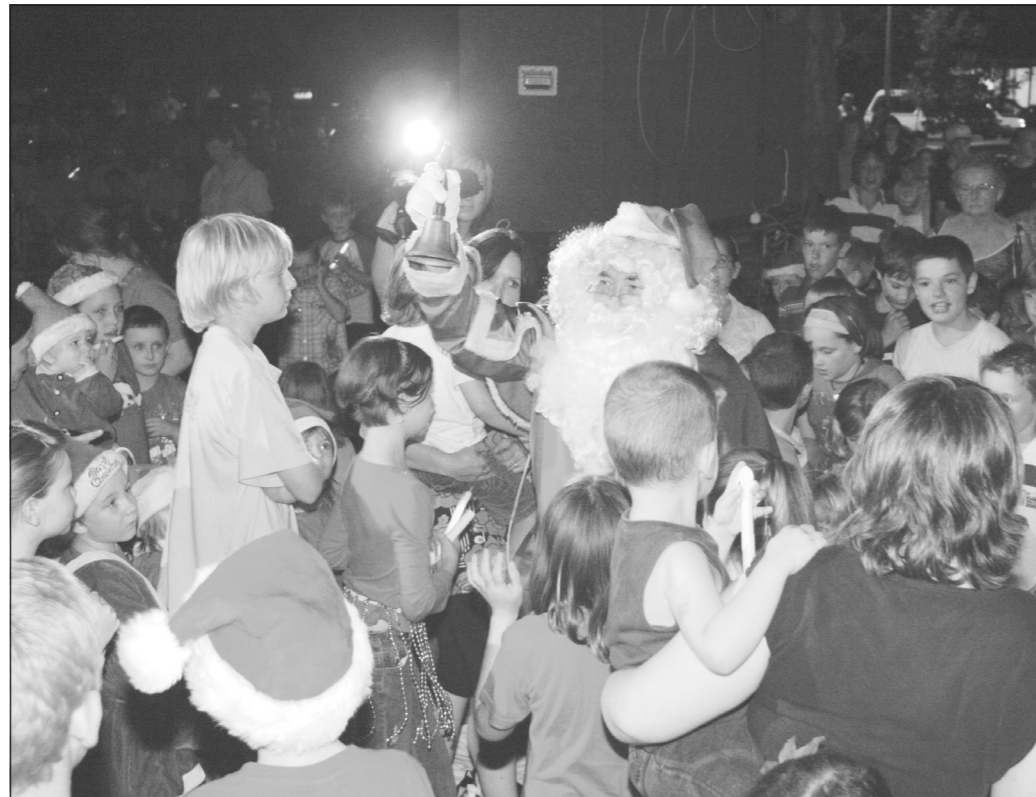
Santa ringing in the merriment at Warwick's Carols in the Park.