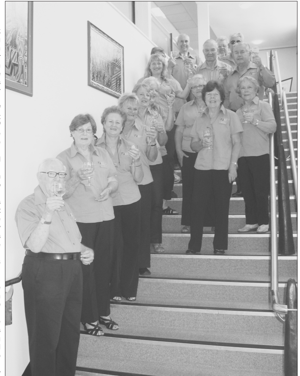
Staff and volunteers at the Warwick Visitor Information Centre are toasting their success as a finalist at Friday night's Queensland Tourism Awards.

"Their dedication to the tourism industry in the Southern Downs area is genuine and I am sure colleagues, as well as their tourism industry peers, congratulate them on this fine achievement."