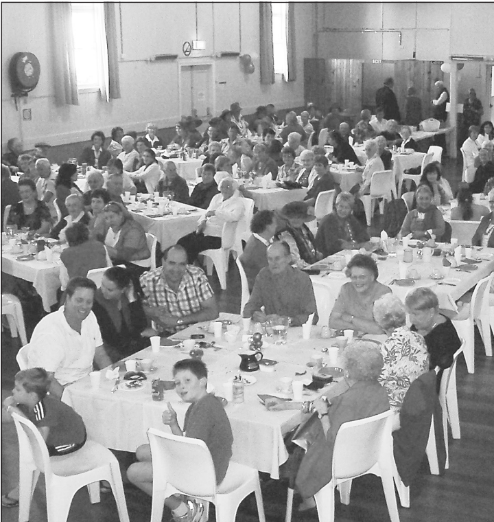
The Allora Community Hall was fully packed for the Allora Scope Club's Afternoon Tea.