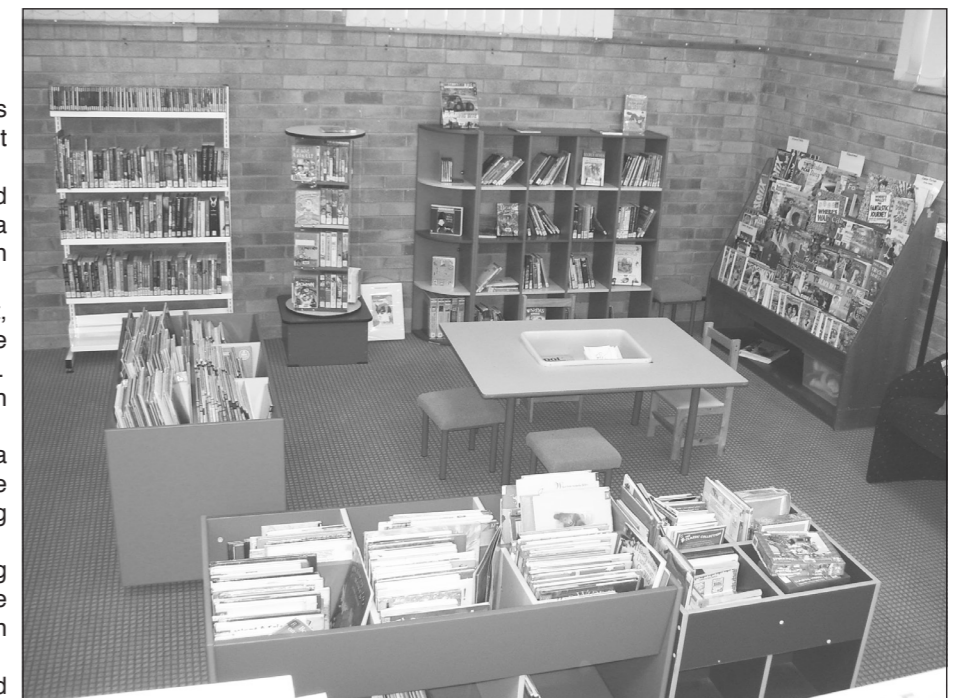
Inside the Allora Library at Herbert Street

Enquiries may be directed to the Allora Library by telephoning 4666 3742 between the hours of 1pm and 5pm, or the Warwick Library by telephoning 4661 0342 during normal library hours.