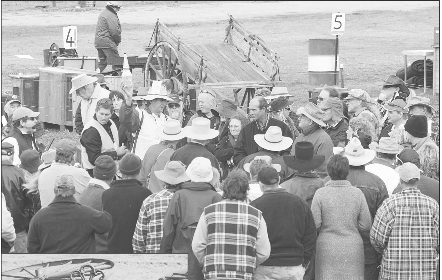
An antique oil bottle goes under the hammer at the Annual Allora Community Auction. - See more Auction photos inside.