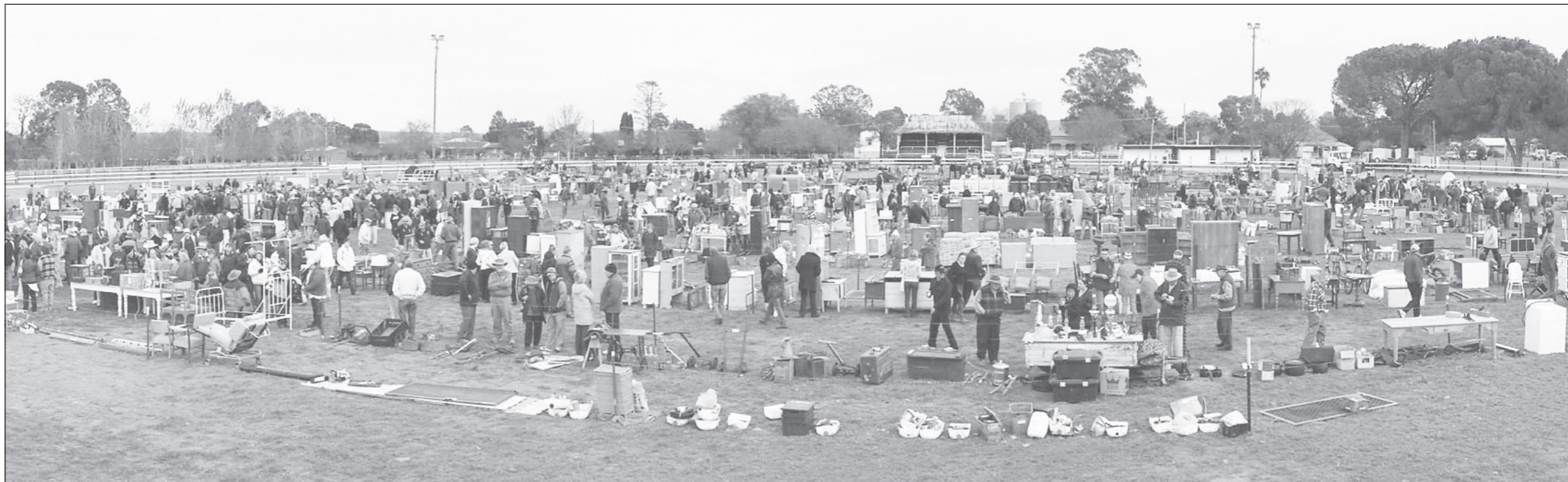
ABOVE: The showground arena bustling with auction activity on Monday morning.