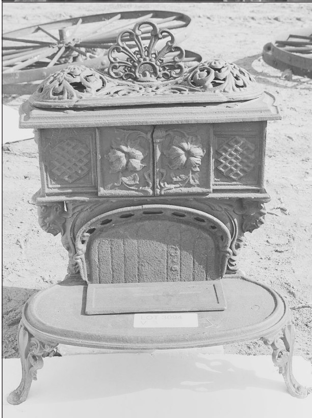
Just what you need for the winter, one of several combustion stoves up for grabs at the Allora Auction.