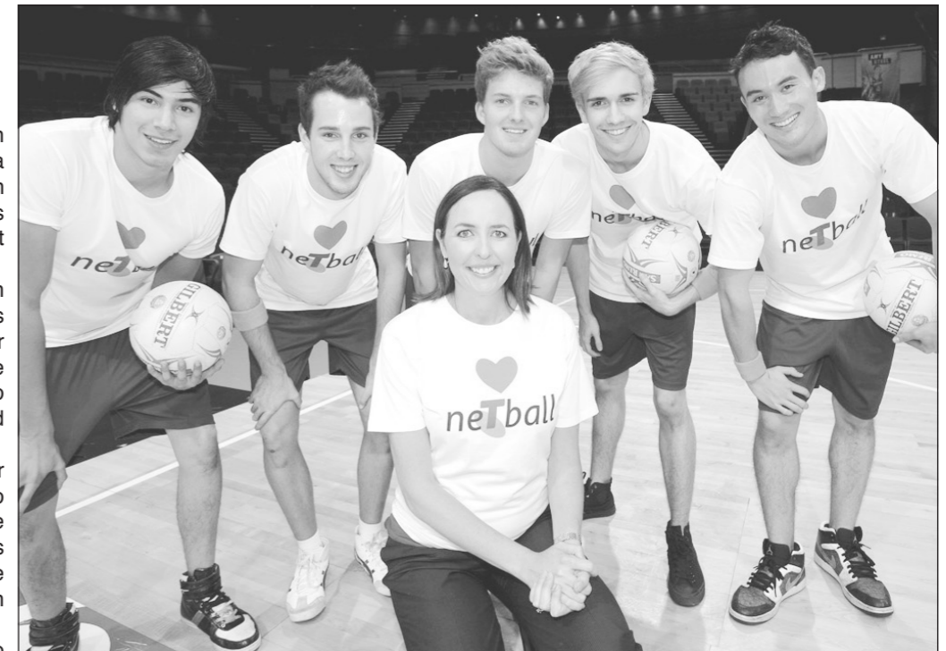
Liz Ellis with the Telstra Netboys

Telstra is offering netball teams in Allora the opportunity to win a training session with Australian Netball legend Liz Ellis. This offer is open to all South East and West Queensland netball teams. Telstra Ambassador, Liz Ellis is keen to share her knowledge of netball as she takes on the role of "Super Coach" for the day for the favourite team of one lucky netball fan who demonstrates a deep passion and commitment for the sport. Ellis has had a remarkable 18-year elite sporting career including two Commonwealth Gold Medals, three World Championship Gold Medals and four National League titles; she is also the most capped Australian Netball player of all time. "I love netball and it's great to see so many people enjoying the game and supporting their local teams. "I'm looking forward to sharing some of my knowledge, skills and expertise with players that are enthusiastic and committed to the sport," she added.