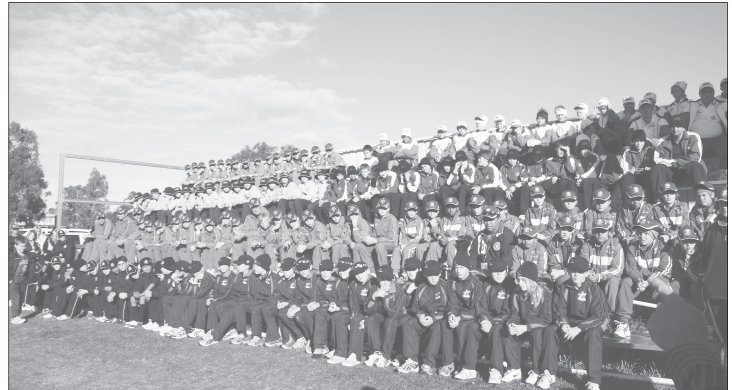
The teams participating in the Zone 5 Under 43kg Junior Rugby League carnival include McIntyre, Balonne/Barwon, South Burnett, Western Downs, Central Downs, Wynnum Manly, Cunnamulla and Warwick.

THIS FRIDAY NIGHT, 9th JULY 8.00pm - midnight