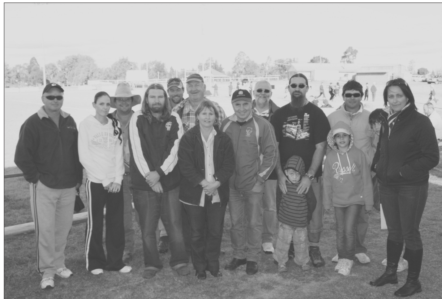
Some of the mums and dads of the Central Downs boys getting together to discuss tactics at the recent Zone 5 Carnival.