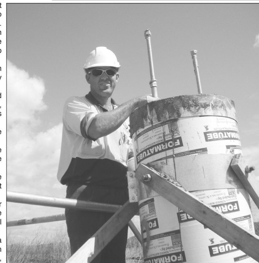
Building the new pillars for the sewer main from the industrial estate in Kenilworth Street, Warwick.