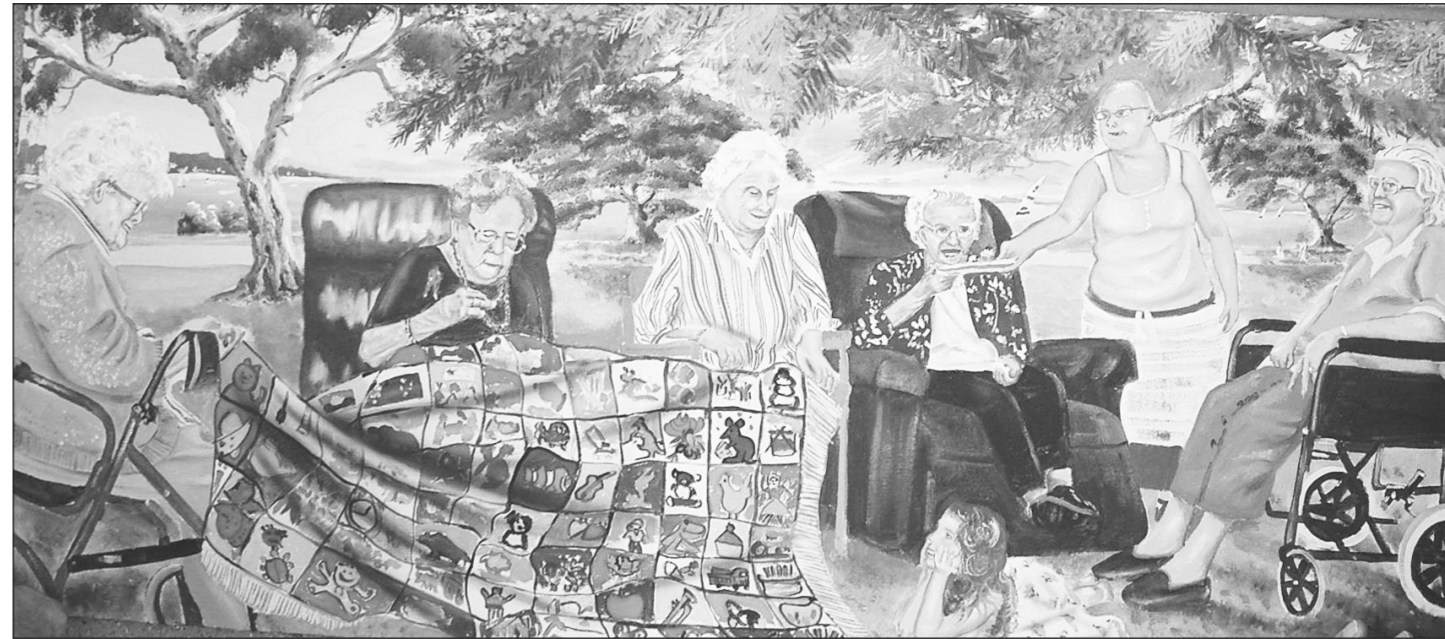
ABOVE: The draft of the Nicholson Bros. Mural.

Cut out and drop this entry form into the entry box at the Allora Advertiser office. The first 3 correct entries drawn on Friday, 6th May 2011 will win a book. Winners will be notified by phone and published in the paper.