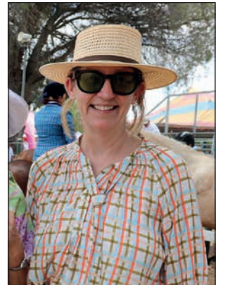
Melissa Hamilton - Mayor of Southern Downs Regional Council.