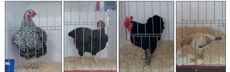
Champion Poultry exhibits.