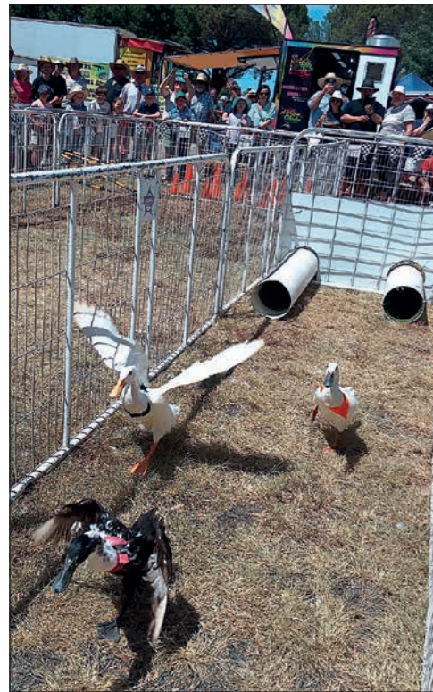
Duck racing obstacle course.