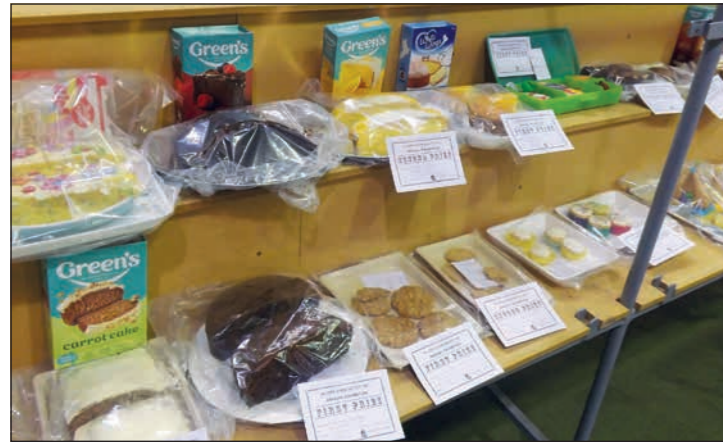
Many scrumptious cake and biscuit entries on display.