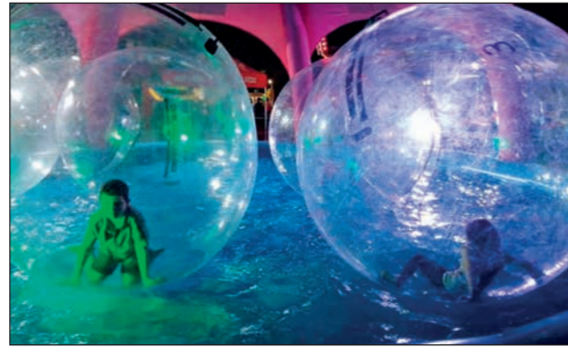
Kai and Elouise battle it out in the Water Balls.