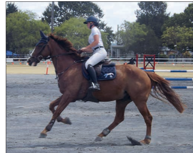
Horse events continued over both days.