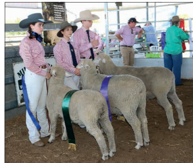
Scots PGC - Champion Rams. Winner (centre) and Reserve Champion (left).