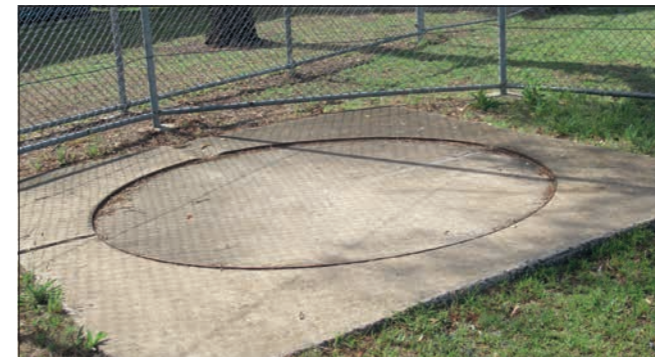
Allora Cricket Ground Discus Ring, which is near the fence of the School.

After the public consultation period, a report will be presented to Council for the final decision on the proposals.