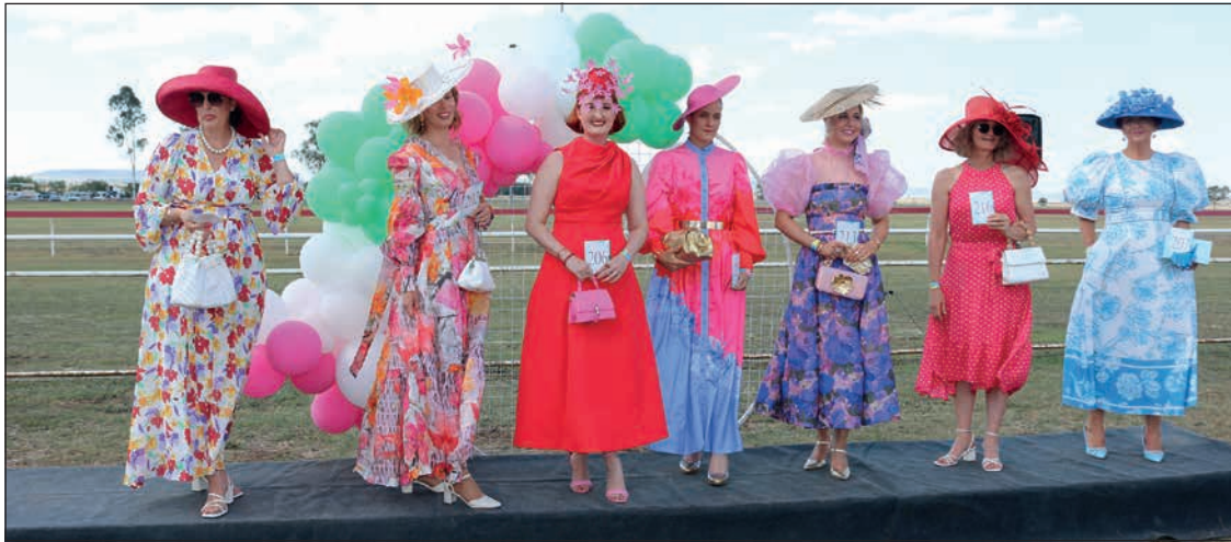
LEFT: The ladies turn out in their latest colourful fashions and even the men were dressed to the nines.