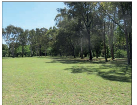
There are many areas in Dalrymple Park that are suitable for a walking path.