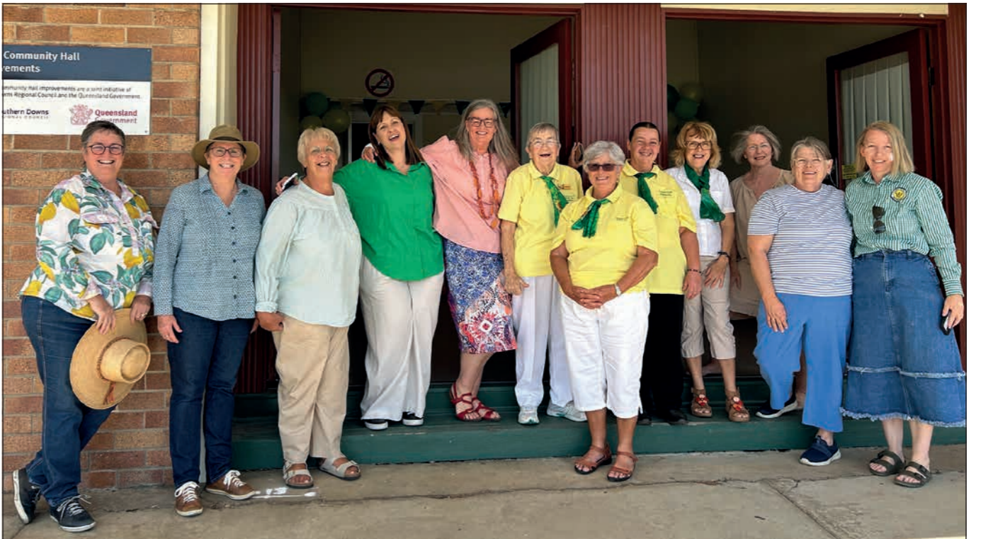
Some of the wonderful helpers who made the day such a great success.