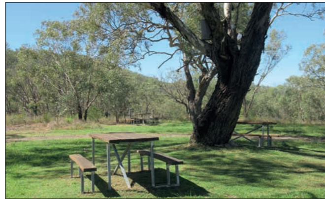
Allora Mountain picnic area

A visit to this special tree has been planned as part of the Cicada Woman Tour taking place on Sunday 28 September.