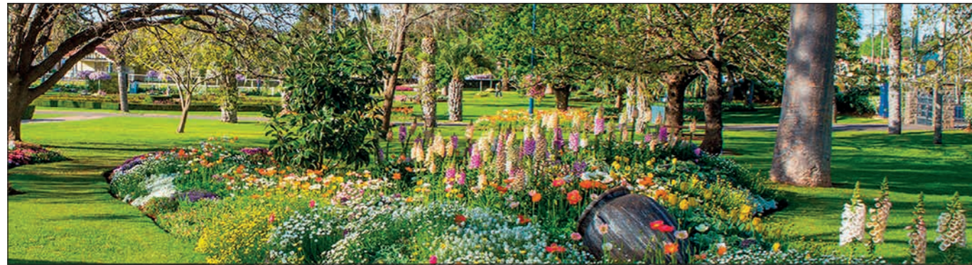
Laurel Bank Park.