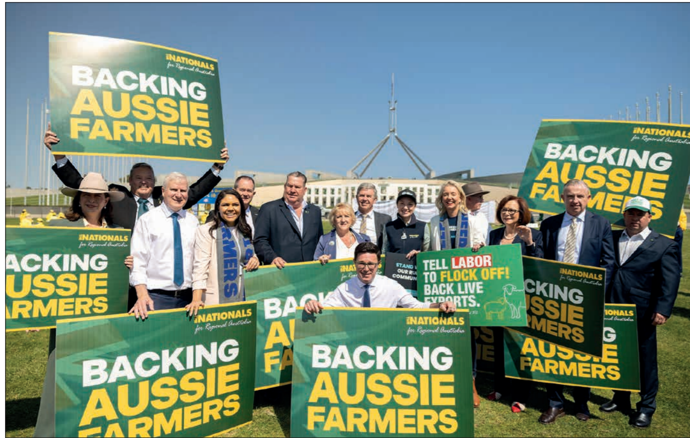
The Nationals at the National Farmer Rally.

Prime Minister Anthony Albanese has refused to attend the National Farmer Rally outside Parliament House, ignoring hundreds of farmers who travelled from all over Australia to plead with the Labor Government to stop its anti-farming agenda.