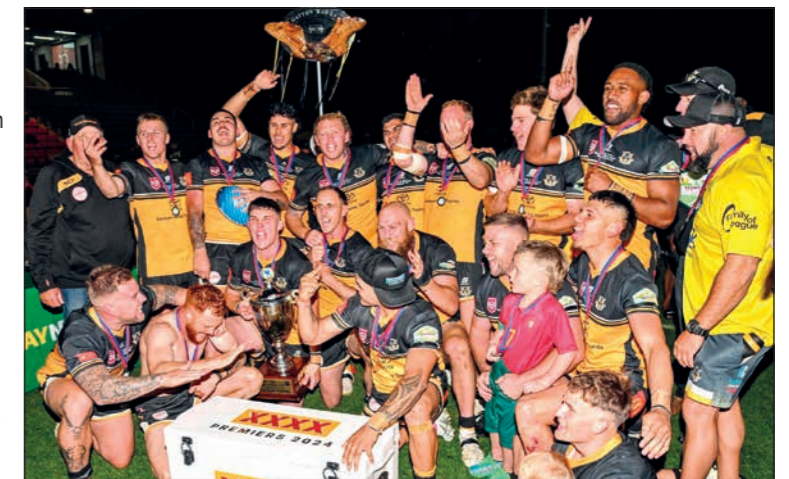
The Gatton Hawks A Grade side celebrate their extra time Golden Point 24 – 20 win over the Valleys Roosters in Saturday's Toowoomba Rugby League Grand Final.