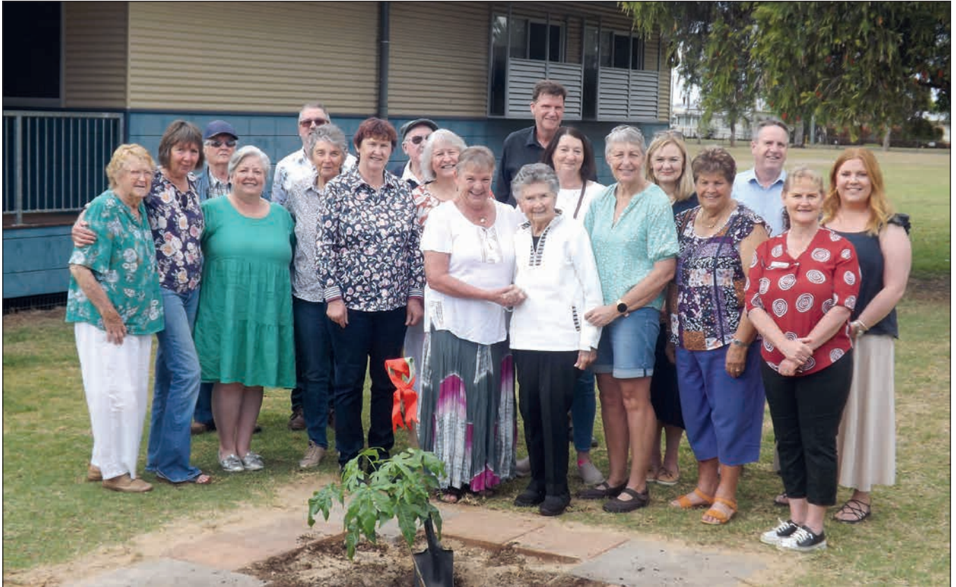
To celebrate 50 years of Early Childhood Education at Allora P-10 State School, former and current staff, students and community members gathered to acknowledge this significant milestone. (more on pages 4 & 5)