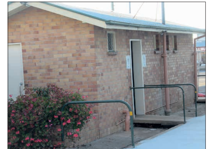
Muir Street toilet block ready for use.

While the toilets have been out of action it has been a difficult time for locals and visitors to town as they had nowhere to go within the business centre.