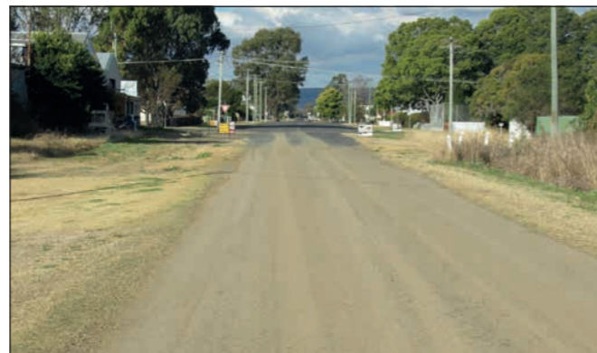
Darling Street now with no pot holes.