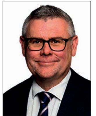
MURRAY WATT no longer Ag Minister.

"There won't be too many farmers sad to see Murray Watt's departure and