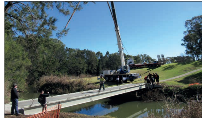
TOP: Lowering the bridge into position. TOP RIGHT: Golfers stress testing the new structure. RIGHT: Completed bridge.