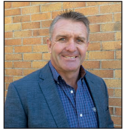
Locals are always happy to see Shane Webcke back in town.

Coming to Allora on Friday are some well known ex NRL players - Shane Webcke, Trevor Gillmeister and Ben Ikin. They'll be in town for the Allora Sports Museum Long Lunch at the Commercial Hotel. Unfortunately the lunch has been sold out but you'll no doubt see these footballers getting around Allora. Just a reminder that the Allora Sports Museum in Herbert Street is open every Thursday and admission is just $5 adults, kids free. All Allora's sporting legends are featured along with a huge collection of national sporting memorabilia. Allora - the home of good Sports.