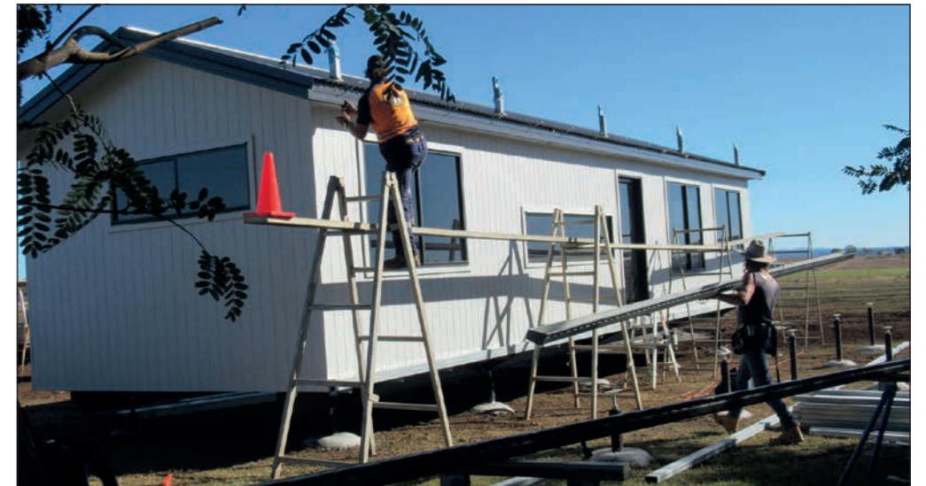
This impressive small home was recently built at Allora.

Neighbouring Councils don't have a minimum size