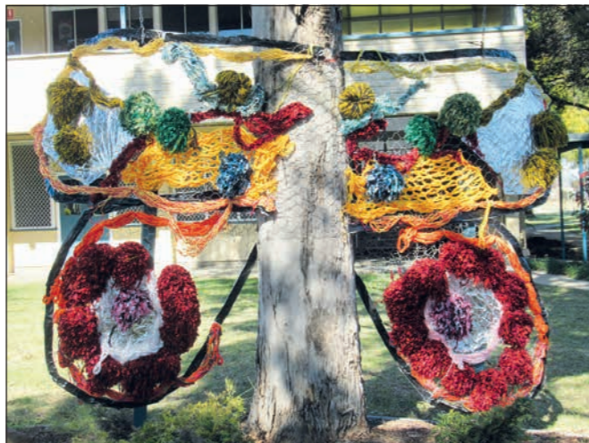
Allora P-10 State School with their artistic display for Jumpers and Jazz.