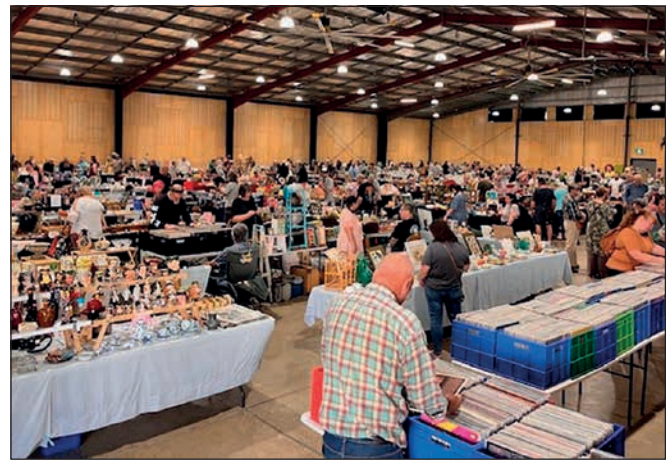
A previous Antique, Collectable and Record Fair.

The popular Antique, Collectable and Record Fair is on this weekend at the Toowoomba Showgrounds.