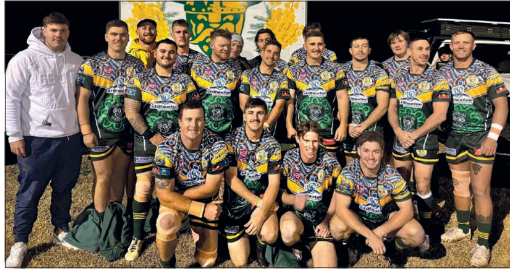
Wattles A Grade line-up wore their especially made Indigenous Round colours in their 62 – 12 win over the Brothers Leprechauns on Saturday evening.

four-pointer, Wattles ran in six unanswered tries across the final forty minutes.