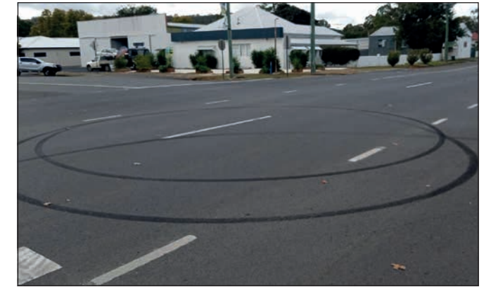
Burnouts will not be tolerated.

There's no need, no room and no tolerance will