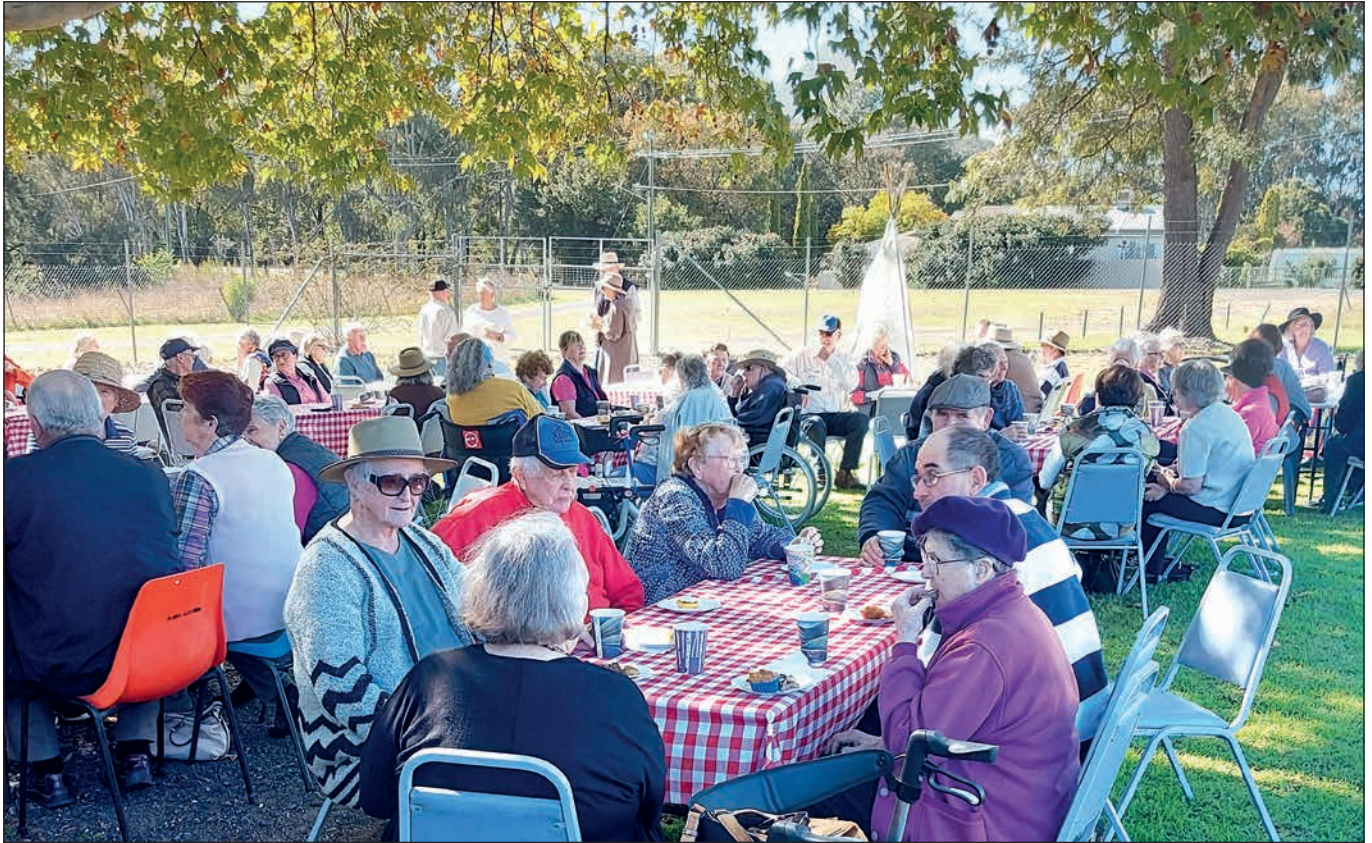
Allora Men's Shed hosted a successful morning tea last Thursday to raise money for the Cancer Council Queensland. A huge crowd turned out to enjoy the social outing while helping a worthy cause.

The commercial real estate sector in Warwick is on the move!