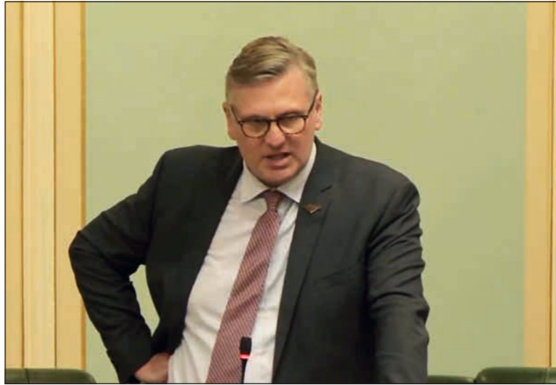
James Lister MP.

zone population increases have been approved via democratically accountable local government processes, and the actions of local landowners themselves. People who have moved into our electorate are entitled to representation from me on state government matters, just as they are entitled to comment on or object to local government over development applications - even if the proposals to which they object are in fact appropriate uses under the local planning scheme zone involved.