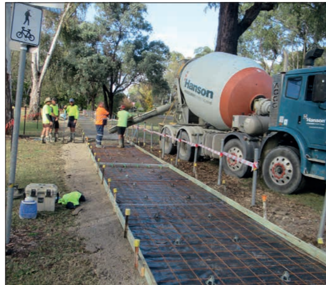
Work being carried out this week with the footpath almost complete.