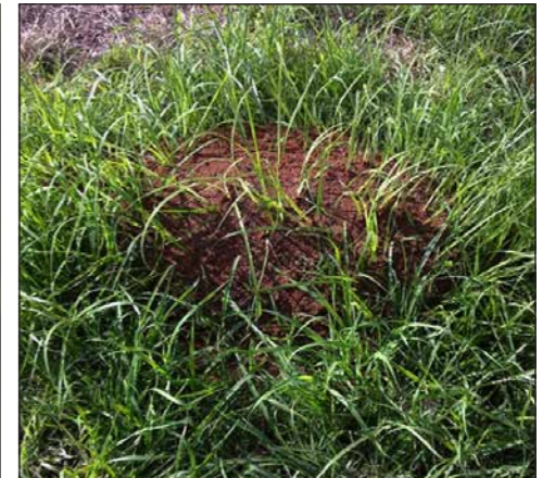
Fire ant nest.

"Everyone in southern Queensland and northern New South Wales should be out checking for fire ants, particularly if you have had any recent material delivered to your property like soil, turf or mulch," said Mr Pianta.