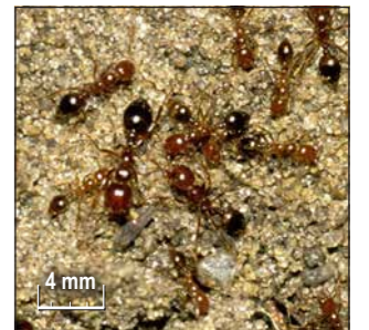
Fire ants.

Fire ants can form rafts during flood events, stowaway in freight or soil, or spread by Queen ant flights of around 5 km per year (and up to 30 km in favourable conditions).