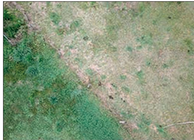
Expression of pasture dieback affecting one side of a fenceline in south-east Queensland.

Pasture dieback is caused by pasture mealybug, a sap-sucking