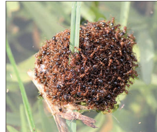
Fire ant raft.

The National Fire Ant Eradication Program has advised that a community member found and reported multiple nests on the Oakey property on 16 April 2024. The nests have been destroyed using liquid insecticide and intensive surveillance activities are underway.