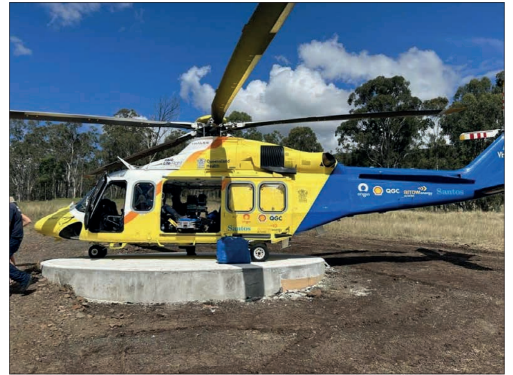
LifeFlight landing on the Pad at Goomburra.

"After a lot of rain, it can be impossible to land at some locations so having a