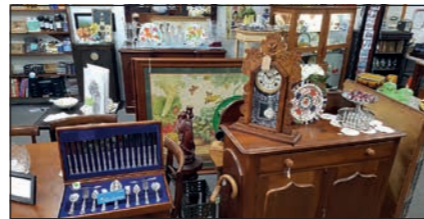
Much More in Store!