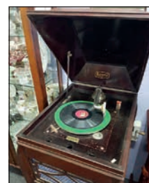
Something For Everyone.