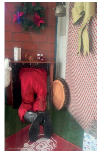
Allora Home Hardware.

The Best Little Town on the Downs will also be the Best Lit-up Town on the Downs.