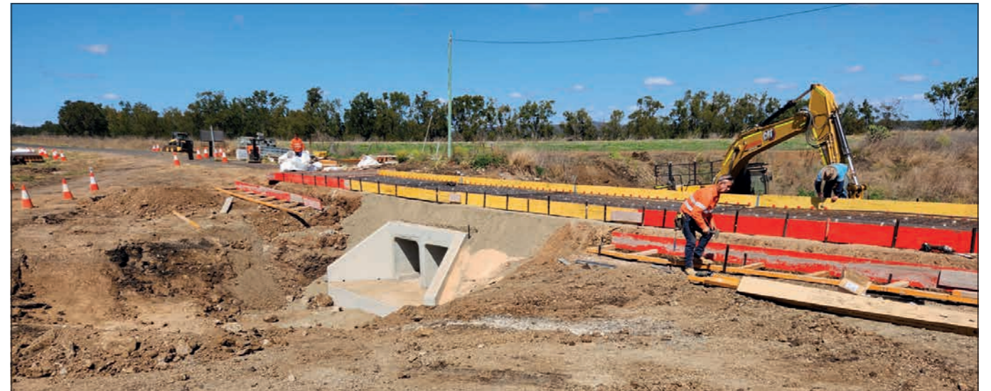
New construction work on West Talgai culvert.

This week should see the last of the concrete poured, making the roadway passable. The West Talgai Road has been out of action since the major flooding early last