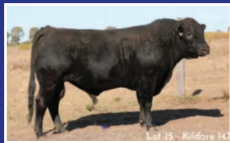
Lot 15 - Kildore 140

Congratulations to the Allora Pony Club on a great event held last weekend. Visitors are always welcome at Showground events.