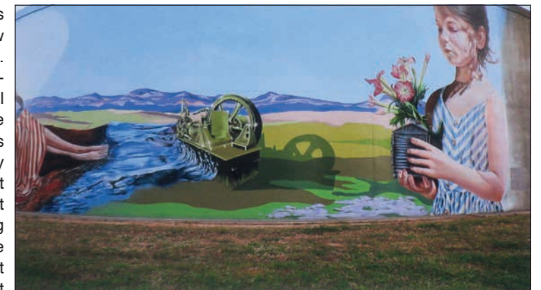
The Texas mural tells a story of life-changing events in the area.