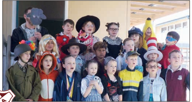
Allora P-10 Year 2 costumes.