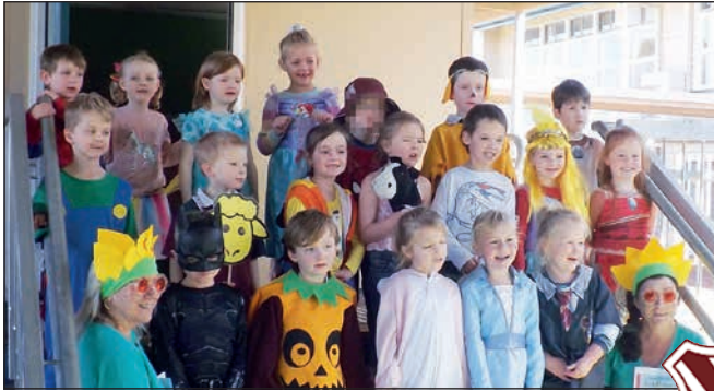
Allora P-10 Prep class costumes.