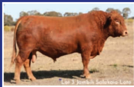
Lot 3 Jambik Salukaloia-Lote