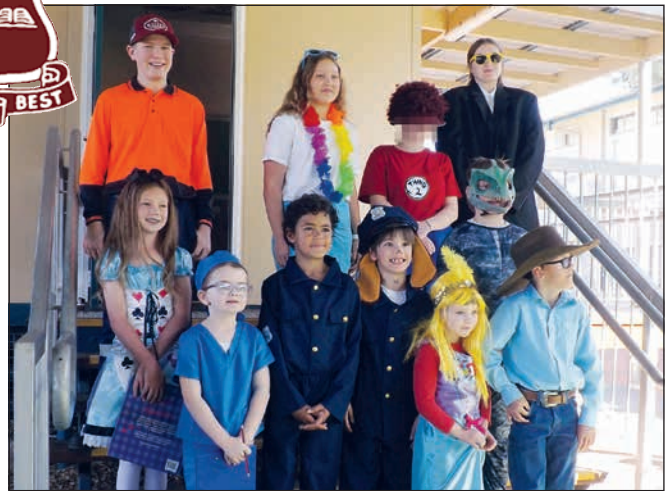
The prize winning book themed costumes across all grades.