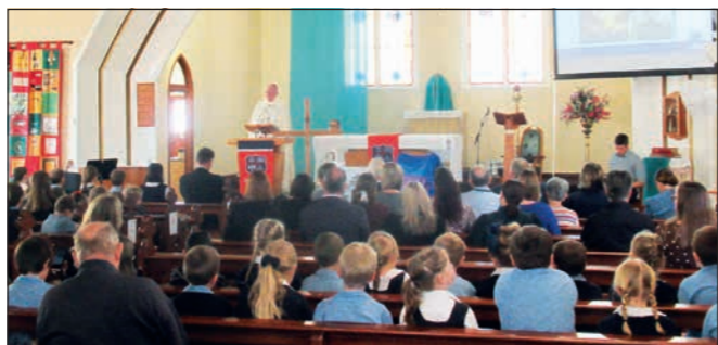
Bishop conducts blessing for refurbished buildings.