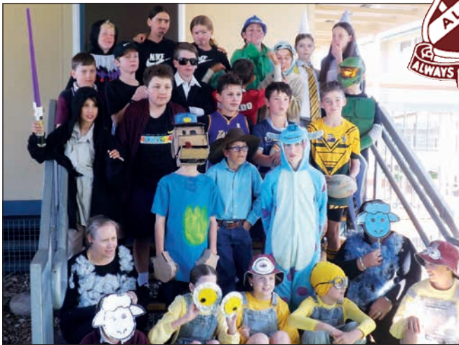
Allora P-10 Year 6 costumes.