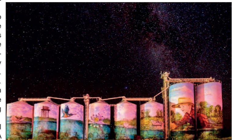
An example of Brightsiders' work on silos at Yelarbon.

two initial designs and only the Allora locals will be asked to vote on the mural to be painted.