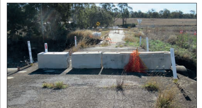
Images showing damage to West Talgai culvert taken before repairs had started.