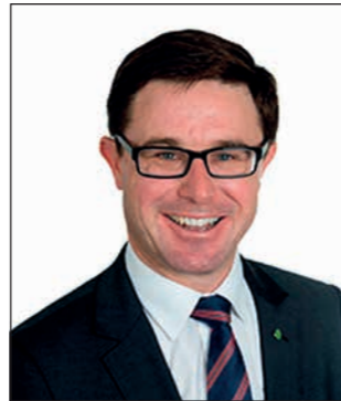
David Littleproud MP.

go to www.haveyoursay.agriculture.gov.au/biosecurity-funding