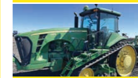
John Deere 8430T Tractor