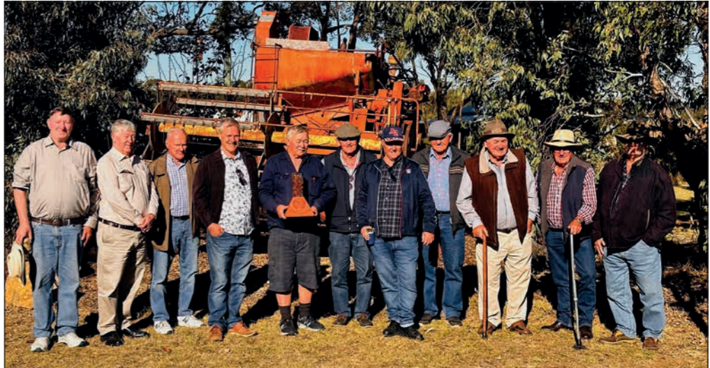
Nolan family male cousins.

The farm at Ellinthorpe was bought in May 1953 on a walk-in walk-out basis with plant, livestock and some furniture. The original farm was 338 acres with more cows than they were used to and life was busy from day one. There