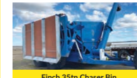
Finch 35tn Chaser Bin