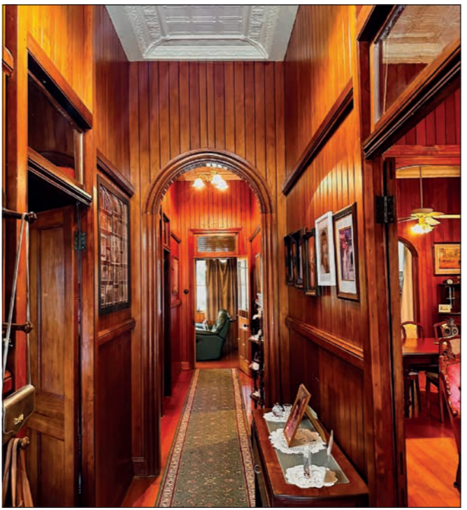
Beautifully ornate hallway, a feature of the Fairfield home.