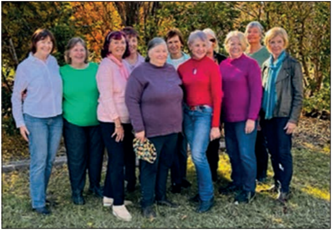
Nolan family female cousins.