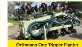
Orthmann One Tripper Planter