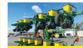
John Deere 1720 Planters x3

STARTS FRIDAY 9TH JUNE - ENDS WEDNESDAY 14TH JUNE AT 7PM