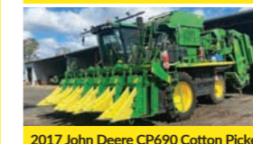
2017 John Deere CP690 Cotton Picker

PICKERS/TRACTORS: 2017 John Deere CP690 Picker, 2013 John Deere 7760 Picker, John Deere 8430T Tractor, John Deere 8435R Tractor, John Deere 8430 Tractor, Case IH MX305 Magnum Tractor, John Deere 7930 Tractor, 2009 New Holland T8030 Tractors x2, New Holland T7050 Tractor, New Holland TM155 Tractor Loader, John Deere 6330 Tractor Loader, John Deere 6320 Tractor Loader, John Deere 6800 Tractor