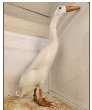
Reserve Bird of Show Indian runner drake.