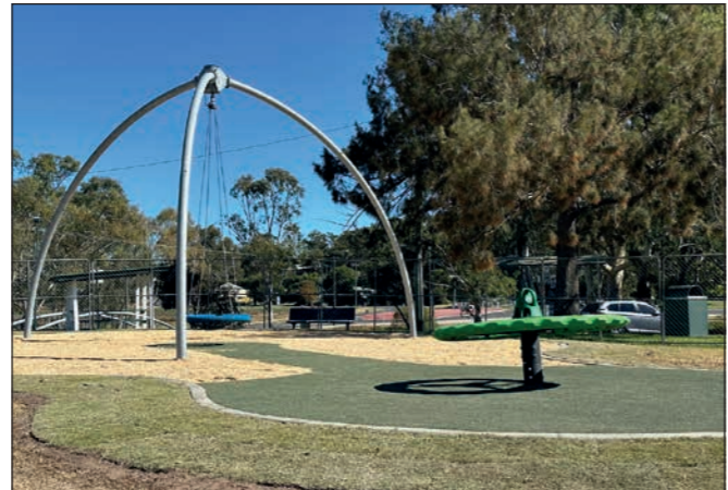
Refurbished Bird's Nest swing now complete in Queens Park.

It's also worth checking out the new outdoor fitness precinct, the bird's nest swing and carousel in Queens Park Warwick. Total investment is approximately $220,000 and will assist in promoting health while having fun.