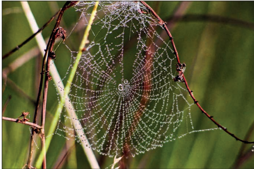
This intricate image taken by local photographer Katelyn Caldwell.