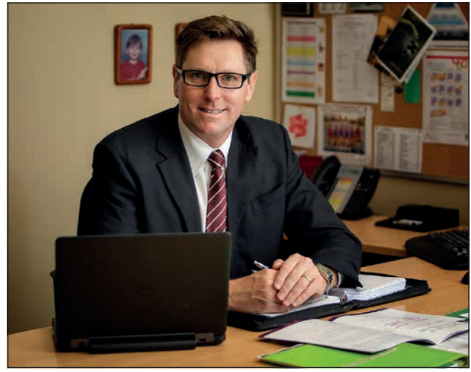
event for our school.

Our school's sesquicentennial in 2017, where we celebrated 150 years of state education in Allora, will always feature amongst my highlights. The school community, who came forth to lend a hand in planning this event in the years leading up to the celebration, was overwhelming and greatly appreciated. It was a wonderful