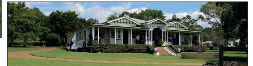
Homestead at Marinya, Cambooya.