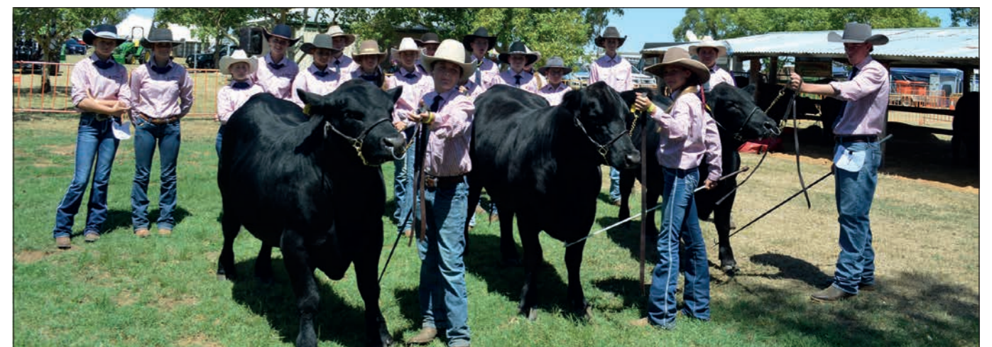
Scots PGC College Warwick with a very strong Team of Black Angus and Led Steers at the 86th Millmerran Show 2023.