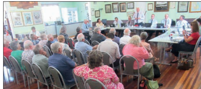
Continued from page 3...

TREE MAINTENANCE Councillors were well and truly made aware what a thorn in the side Bunya pine nuts can be, as well as the negative effect unmaintained trees can have.