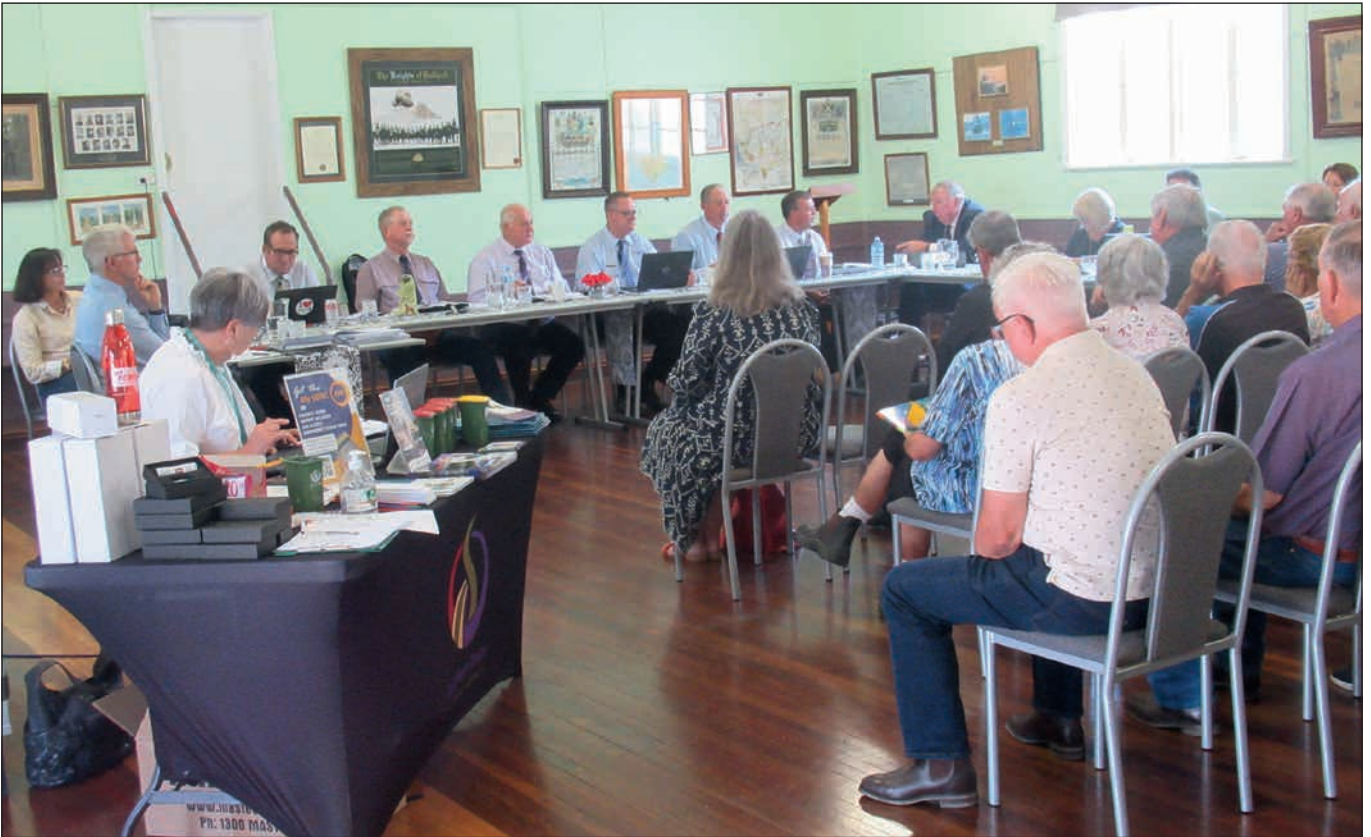
A Connecting with Council meeting hosted by Southern Downs Regional Council (SDRC) in Allora last Wednesday provided an opportunity for residents to speak their minds about issues important to them. (story page 3 & 4)