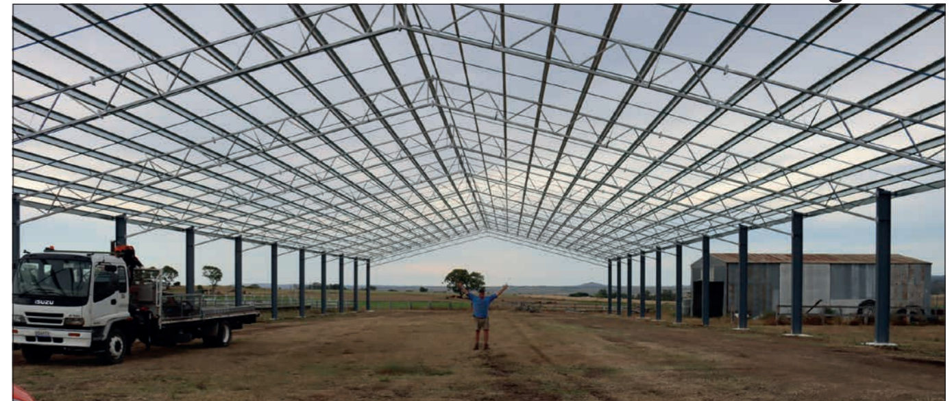
The new arena under construction at Lauralla Lodge.

There's another massive undercover arena in the region