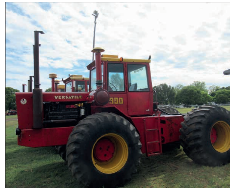
A big attraction were these super-large Versatile Tractors owned by a Collector near Warwick.