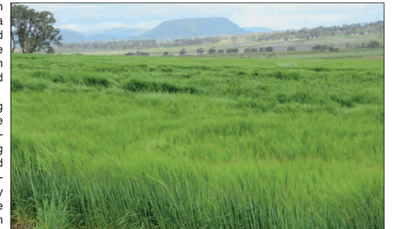
A Barley crop at Glengallan.