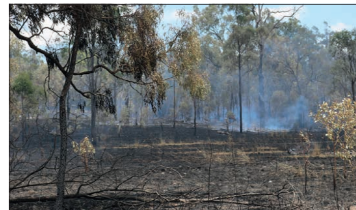
The aftermath of the fire.

There are unconfirmed reports the Old Talgai fire was started by an electric fence.