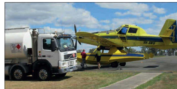
The Warwick Airport at Massie was a hive of activity with refilling of aircraft to fight the fires.