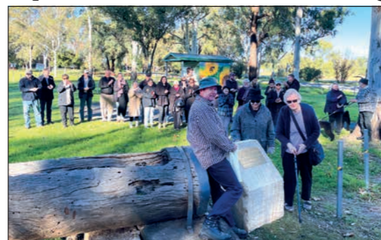
Descendents of the Stark and Busiko families attended the revealing of the plaques on Saturday.