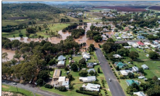
Heavy rain on Sunday and Monday meant the highest flooding seen for many years in Allora.