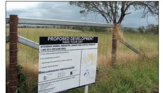
Those wishing to make a submission in relation to a proposed feedlot west of Mount Marshall will need to act quickly with submissions closing on Monday next, 4th April. The feedlot application has been lodged with Southern Downs Regional Council (SDRC) on behalf of the Arolia Pastoral Company