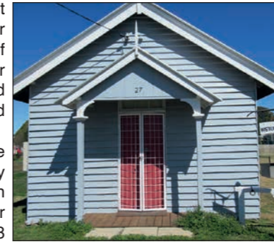
ABOVE: Drayton Street Museum. BELOW: Warwick Street Museum.