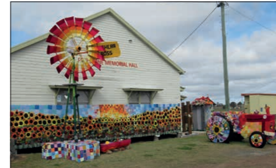
As part of Jumpers & Jazz friends of Freestone Hall delighted visitors with their brightly coloured and detailed display. Look closely and you can see the complex design that makes it so impressive.