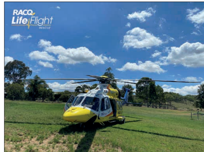
The RACQ LifeFlight helicopter on the local property.

The patient was flown to the Toowoomba Hospital in a serious but stable condition.