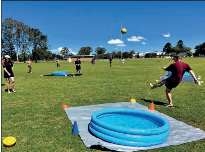
With a kick like that could we be seeing a future Socceroo?