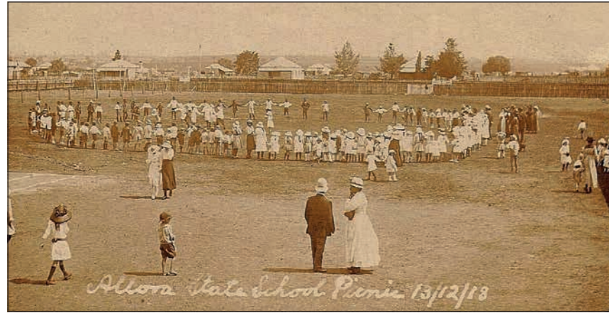
The break-up picnic at the Allora State School in 1918.