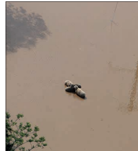
Four sheep huddle together surrounded by floodwaters.

To support Rural Aid or make a donation go to: www.buyabale.com.au