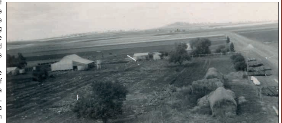
'Villa Farm' (formerly Rickert's) in Kital Road in 1957.