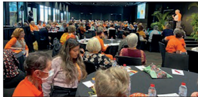
Brisbane Conference of Days for Girls Australia.