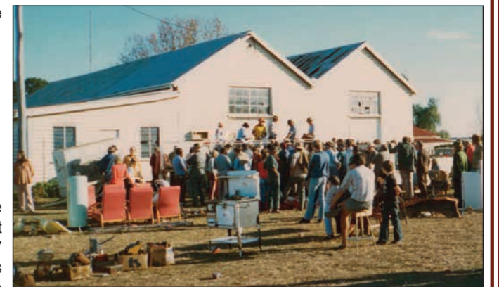
The 1982 Apex Auction showing the old show pavilion with the supper room attached on the left.