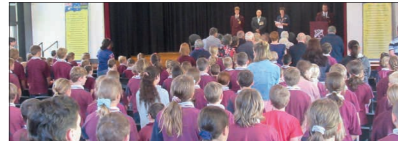
ABOVE: The Hall was packed with students and locals for the service.