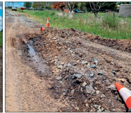
FAR LEFT: Pot holes on Haigs Road (repairs have commenced since this photo was taken)