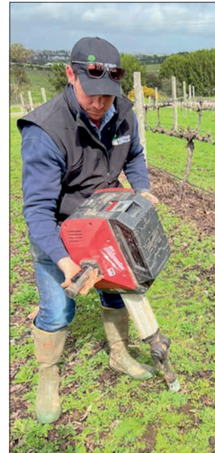
Soil sampling in progress.