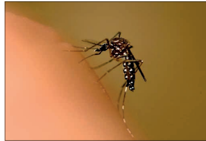
Japanese encephalitis