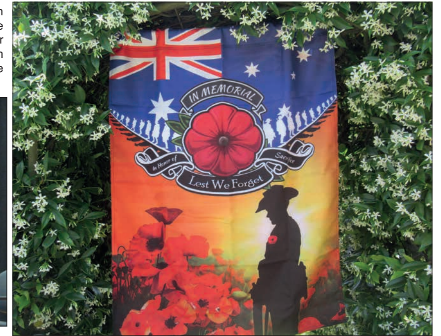
Display by a local resident in Muir Street.