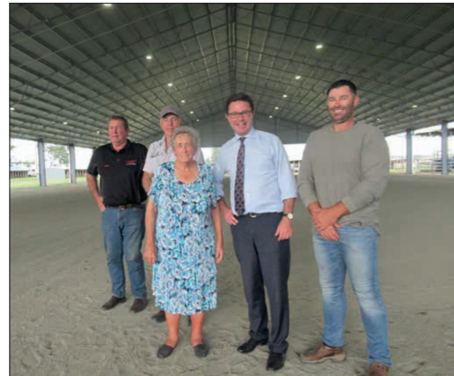
David Littleproud opening Allora's Undercover Arena in May 2022. Allora Show Society's undercover arena at the Showgrounds was completed in 2021 - thanks to the Coalition Government's Regional Agricultural Show Development Grant. Now under Labor the Ag Shows funding has been cut.

"Labor says the funding will be redirected for other government priorities."