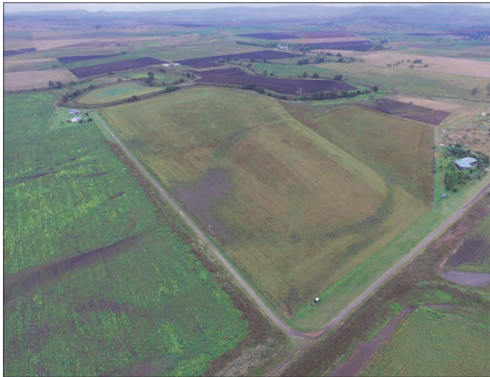
Area before flooding occurs.

Many residents believe multiple floods earlier this year along Dalrymple Creek were made worse by the levee bank, particularly around the corner of Raff and Jubb streets.