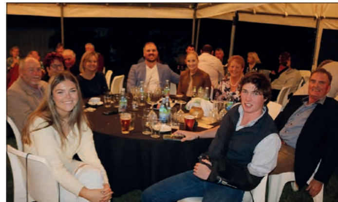
Denny family table.