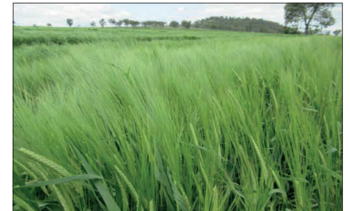
A healthy looking barley crop - swaying in the breeze at Glengallan. This barley will mainly be used as stock feed.

"To lay the blame for methane and nitrous oxide gases from urine solely on beef cattle and other commercial herds is just pure laziness. Any limitations placed on our meat and dairy producers will have disastrous impacts on farming families, small businesses and consumers who will pay more for meat and dairy," she said.