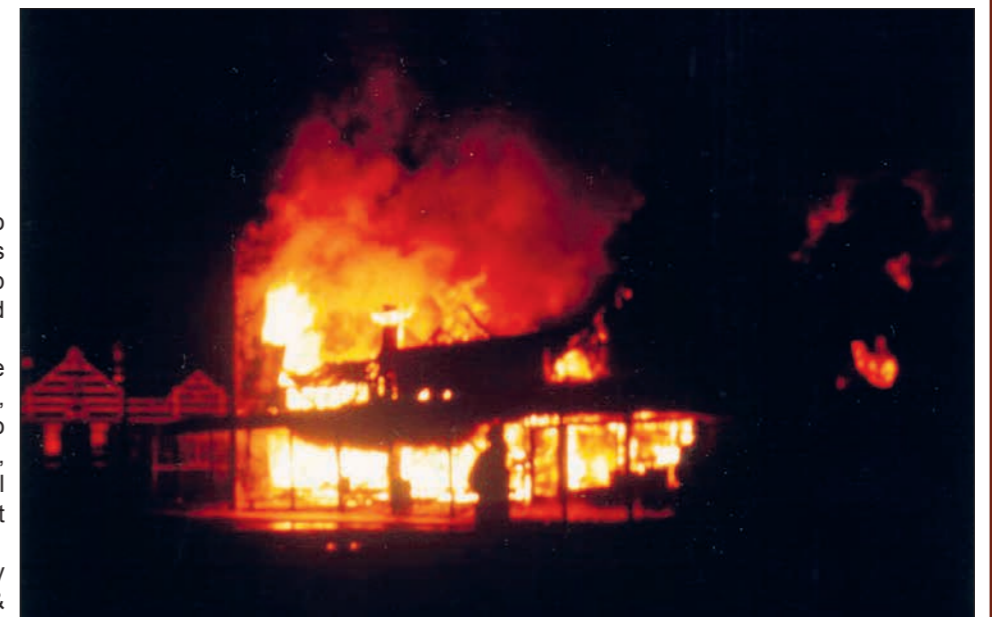
The fire which destroyed Holmes & Co. store on the corner of Warwick and Herbert Streets on the 13th October 1972.