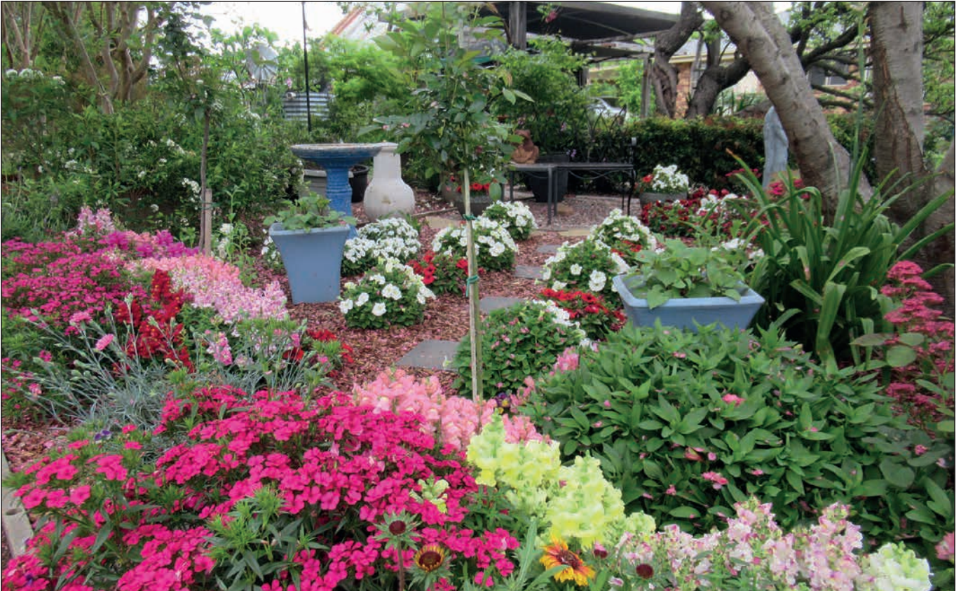
This prize winning garden of Lynn Close took 1st place in the Large Home Garden category - Warwick Horticultural Society Shield. You can view Lynn's garden at 43 Arnold Street, Allora. (more photos inside page 8 & 9)