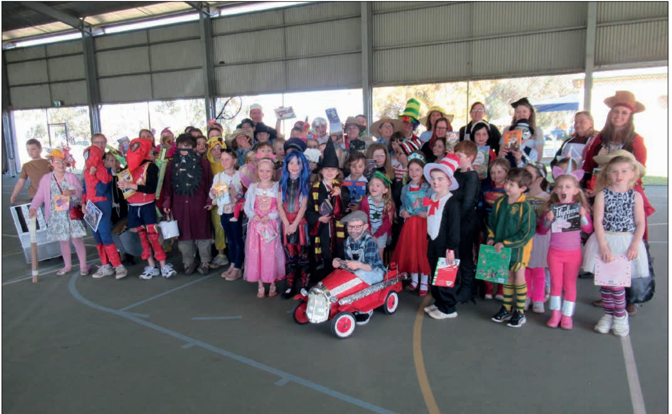
Parents and Grandparents enjoyed yesterday's parade of kids dressed in amazing costumes of the best-loved character from their favourite book. The teachers also took part to the amusement of the kids. Well done St Pats! (see page 3)