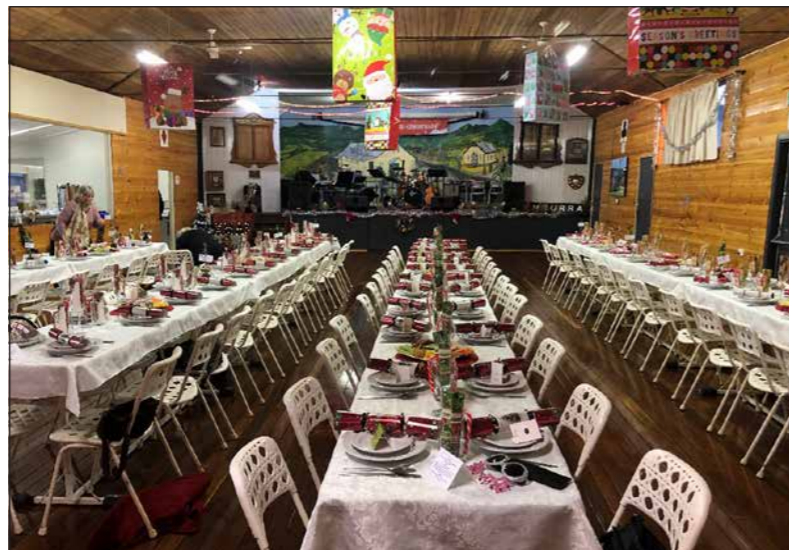
Hall dressed up for Christmas.