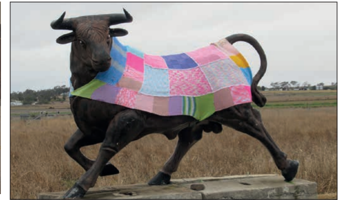
It's the Bockman Bull dressed for the occasion.