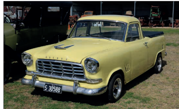
Paul Parker's pride & joy - early model Holden Ute in immaculate condition.