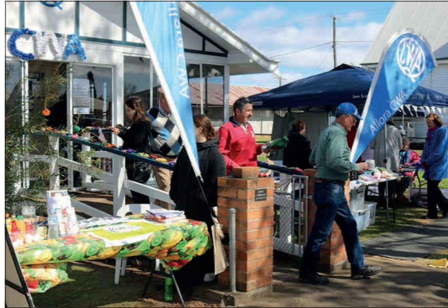
CWA Centre was a popular stop over for hot drinks and tasty food.