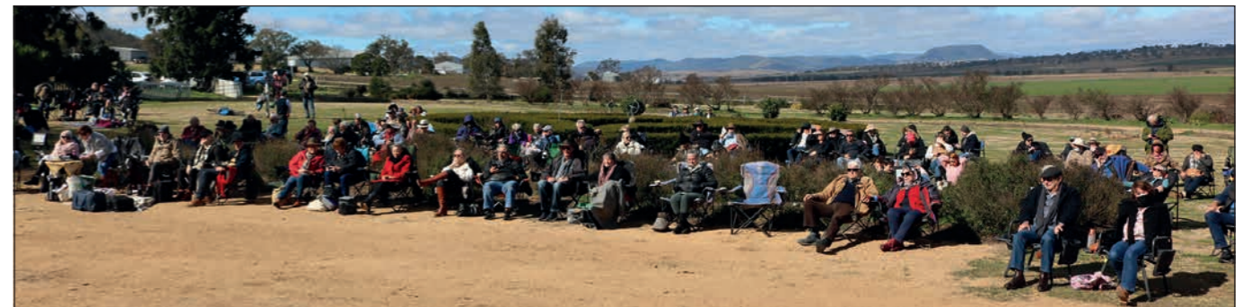
Despite the chilly wind on Saturday, lovers of Jazz and Glengallan come out to relax & enjoy the best of Jazz by the Freud Squad of Brisbane.