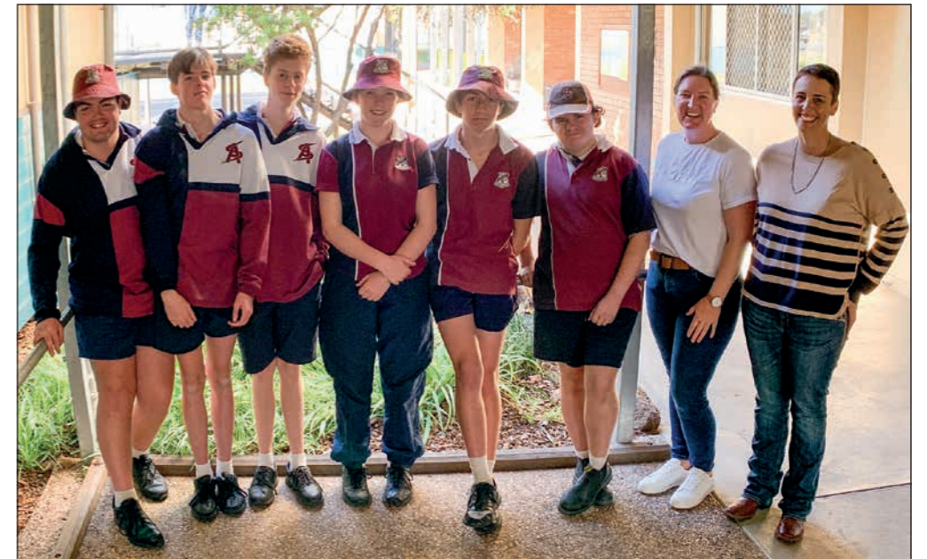
Next year's Allora Campdraft is scheduled from 29 April to 1 May. If you'd like to be involved contact the Allora & District Campdraft Association through their Facebook page - www.facebook.com/ADCAssoc

Funds from this year's event have been donated to the Allora State School to assist the year 10 students in funding their end-of-year trip. A number of these students helped in the canteen over the weekend. Money has also been donated to the Allora Pony Club, Care Flight, Lismore flood victims and to a local family who has suffered a tragedy.