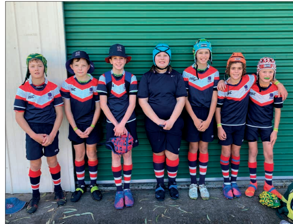
Darling Downs Under 11 team - St Patrick's School Senior Gala Day Rugby League 2022.