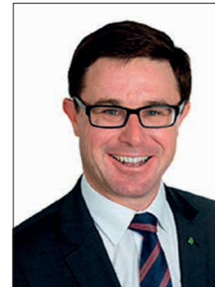
David Littleproud MP.

The Leader of the Nationals and member for Maranoa, David Littleproud said the Agricultural Visa would go a long way to help Australia feed the world, if only the Labor Government would listen to farmers and not their union masters and reversed the decision to scrap it.