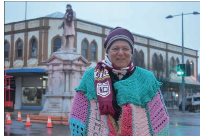
Yes, this IS the Mayor in his new look mayoral robe.