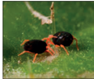
Redlegged earth mites.

For further information about the resistance testing service