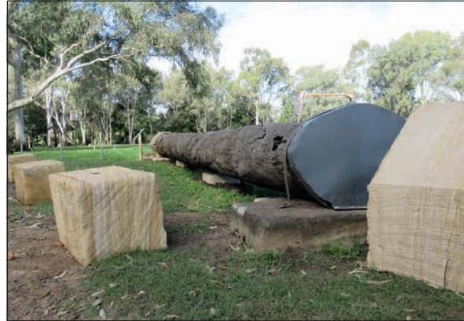
Solid supports now installed to support the trough.

Those who wish to attend be at Stark's trough at 8am with the grand revealing of the plaques at 8.30.