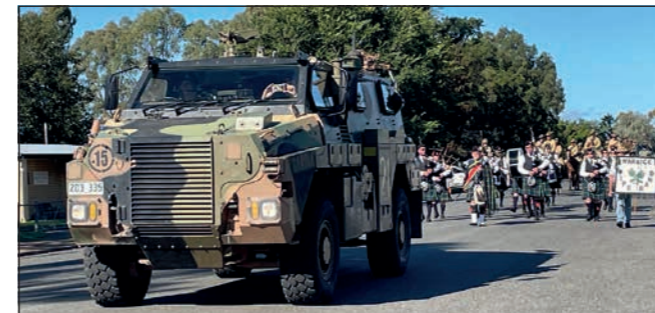
Turn to page 8 for more Light Horse Parade photos.