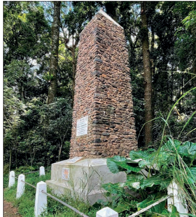
Allan Cunningham Monument.

A jar containing current newspapers, lists of local council and State Government dignitaries, a list of names of the volunteers and contractors working on the road project, as well as coins, were embedded in the monument's