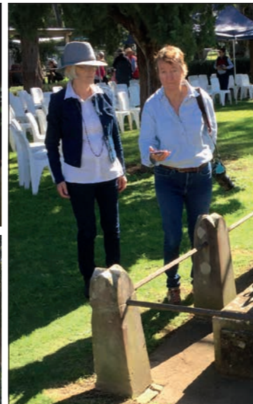
Grand-daughter and Great Grand-daughter of Brevet-Lieut-Col H.C.Chauvel c.mc.