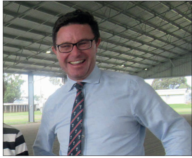
David Littleproud recently in Allora to officially open the "Big Shed".

for Condamine and later Western Downs from 1983 to 2001. Maranoa is the largest electorate in Queensland - with an area of 729,897 square kilometres or 42.2% of the State. Mr Littleproud has held a number of rural related portfolios with the most recent being Minister for Agriculture and Northern Australia until the Coalition lost the Election last month. NSW Senator Perin Davey who lives near Denilquin was elected deputy leader.