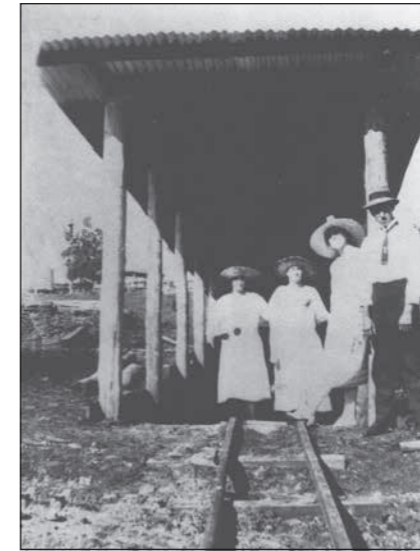
The pit head of the Allora coal mine c.1920.