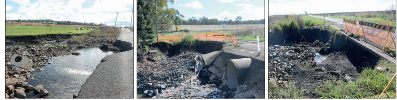
Merivale Street, Allora. Talgai West Road, Talgai. Buckles Road, Talgai.