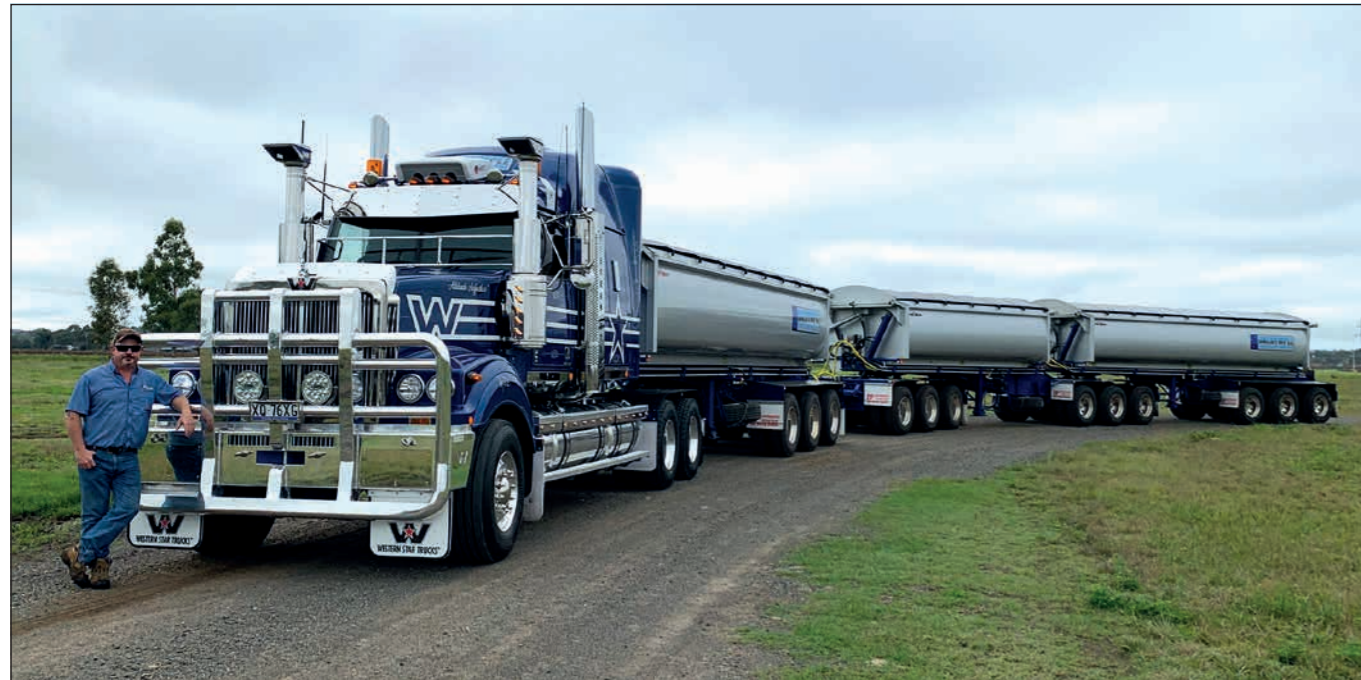
Brenden Cook with his latest purchase "Attitude Adjustar".

A 2022 Western Star Constellation Series 4964 FXT X15 - Limited edition "Cheyanne" #11 (Lucky last off the production line)