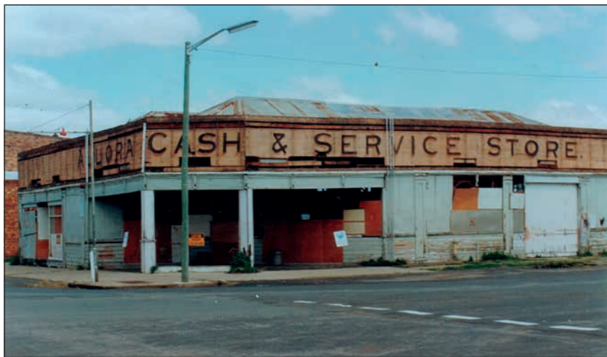
The demolition of the old Barnes & Co/Allora Motors building.

The Clifton juniors defeated the Allora juniors by 3 points to 2 on Sunday at the Allora Show Ground, this being the first time this season the junior team had been defeated. In the senior game, Allora won by 2-nil. The ground was muddy and it was showering lightly throughout the game with the result that the ball became greasy and was difficult to hold. The Clifton backs showed better form than the Allora backs, although these are improving with the progress of the season. The Allora forwards, however,