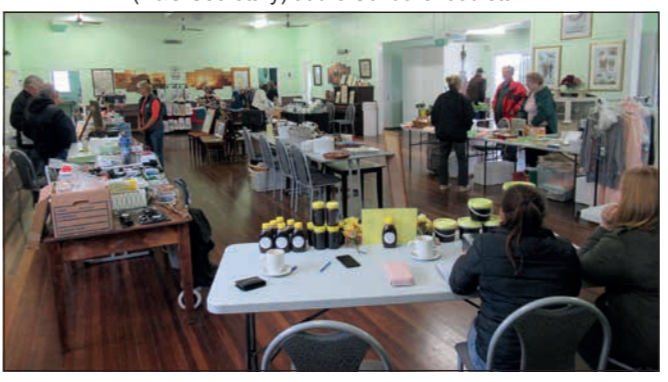
Locals enjoyed strolling around the markets in the RSL Hall.