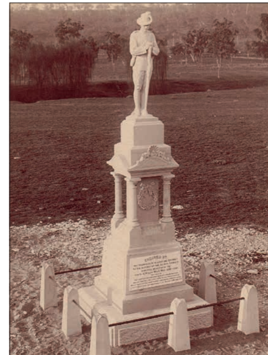
Boer War Memorial - Allora 1904.

Allora had a Light Horse Regiment before the Boer War started and a number of men from Allora were in the Light Horse Regiment during WW1.