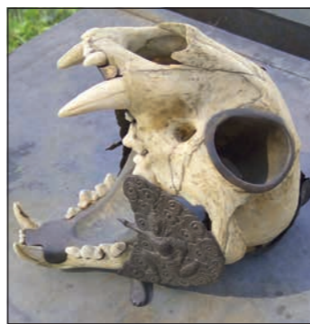
Thai Tiger Skulls like these were sold as Tibetan Tiger Skulls in Thailand in days long past.

Interested persons are invited to contact Rhianon on 0420 353 800.