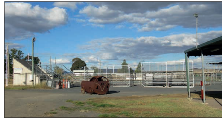
From here... (Site for the arena.)

The all-weather all-purpose undercover arena at the Allora Showground received $340,495 through the Federal Government's Regional Agricultural Show Development Grants program in May 2020.