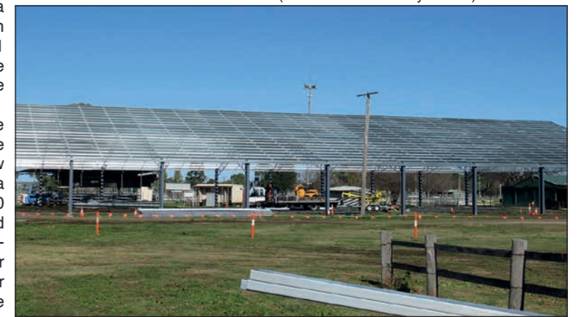
to here... (Arena taking shape.)

Nutrien Ag Solutions is committed to working with producers in the Allora region to help them grow.