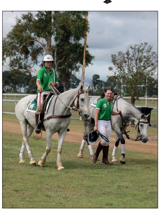
Warwick players ready for their match.

two-day Carnival before heading to Warwick this Friday, Saturday and Sunday where they'll compete in the Barastoc Interstate Series and Shell Cup Carnival.