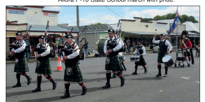
Local identity Spurs follows the band.

Crowd moves on to Cenotaph for Commemorative Service (photos page 7)