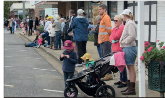
Crowds lined the streets to show their appreciation.