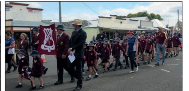
Allora P-10 State School march with pride.