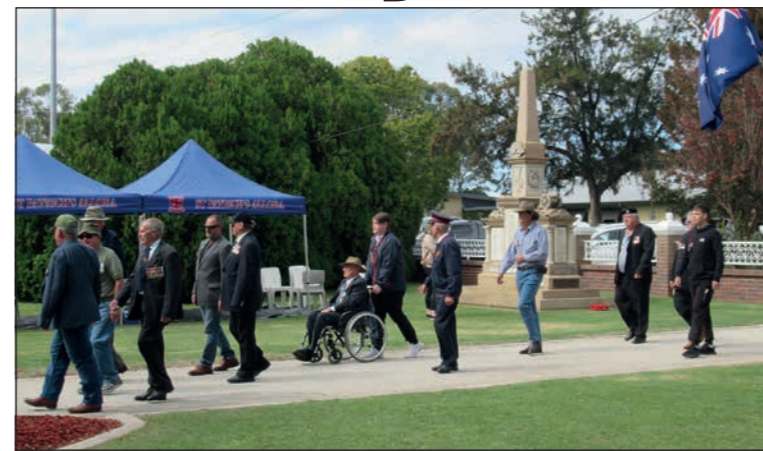
The arrival to the Cenotaph of our RSL Sub-branch Parade marchers.