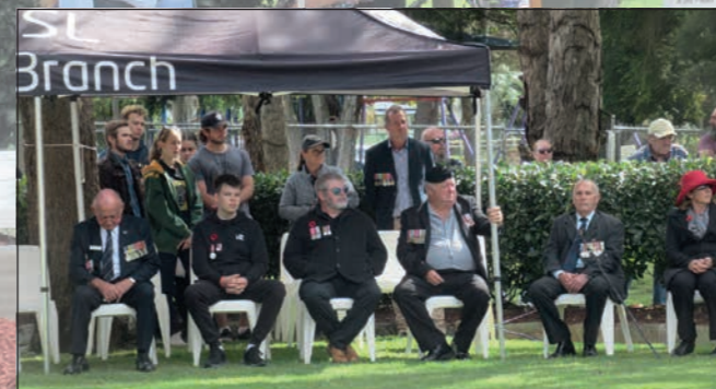
Members of the Allora RSL Sub Branch not missing a moment of the Commemoration Service.