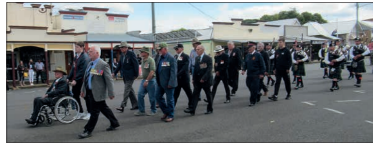
Allora RSL members and ex-servicemen, the highlight of the parade.