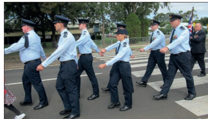
Members of the Royal Australian Air Force.