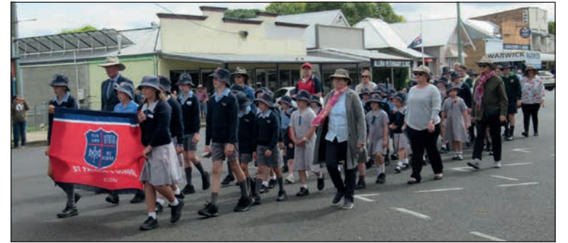
Students & Teachers of St Patrick's School Allora.