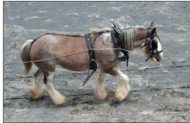
Be amazed by the strength and beauty of the heavy horse.

The Gatton Heavy Horse Field Day is the longest running heavy horse event