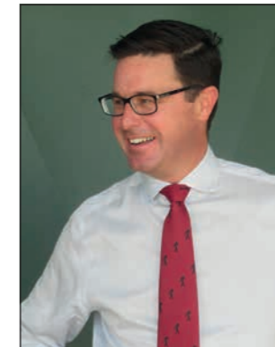
David Littleproud MP

"This is not a free for all – applicants will need to