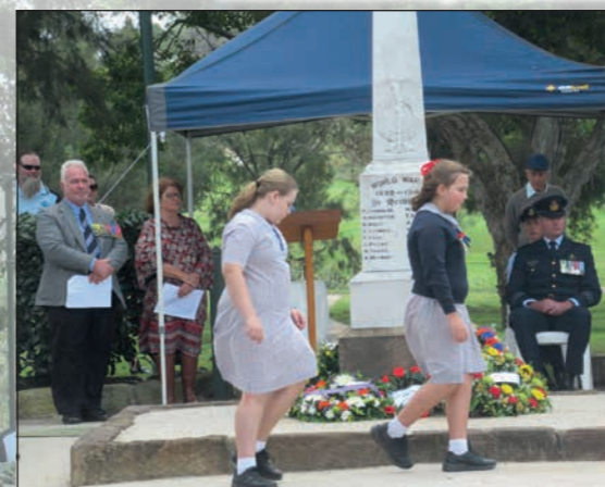
Wreath laid by students from St Patricks School Allora.