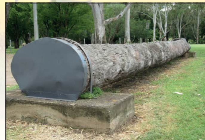
Stark's Trough in Dalrymple Park - an important part of Allora's history