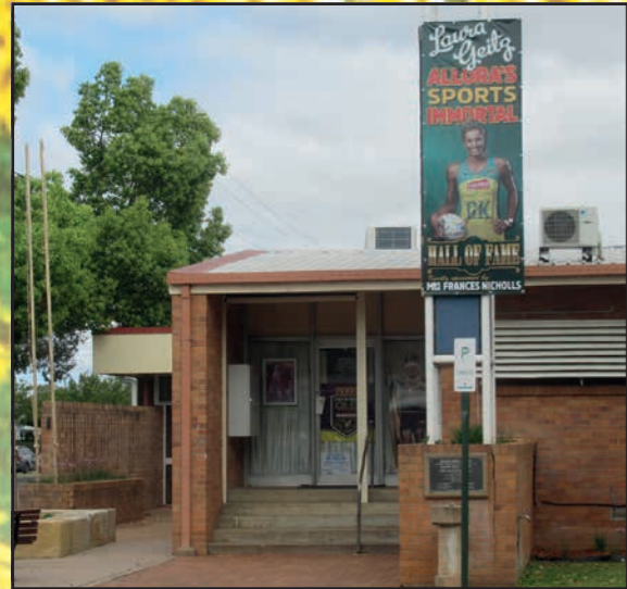
Allora's Sports Museum - a mecca of sporting history - to visit phone 0407 034 320.