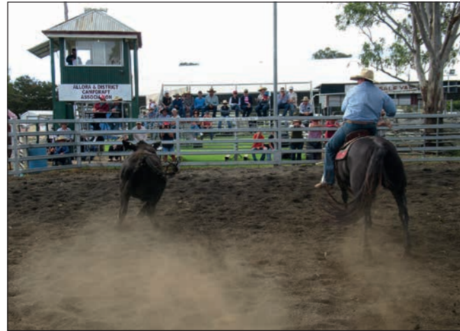
Allora & District Campdraft saw three days of top class riders showing their skills to the huge crowds at the Allora Showground over Easter.