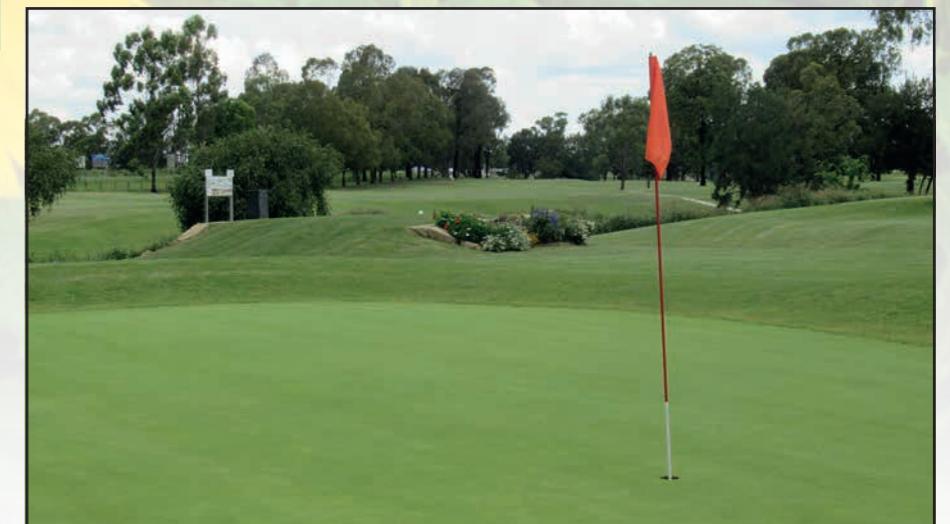
Hit a round on our picturesque 18 hole golf course.