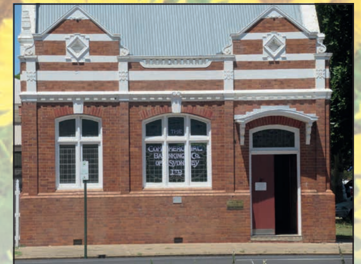
Standing proud at the end of Herbert Street - the old CBC Bank building.