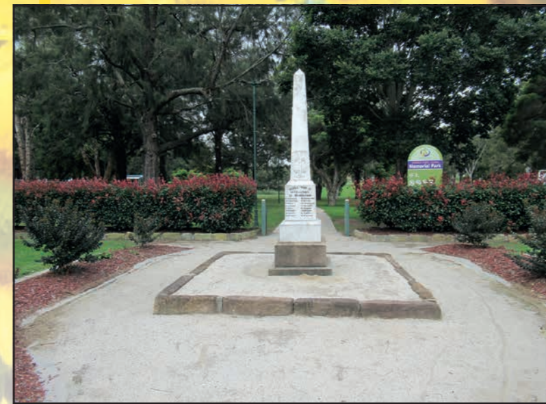
Allora War Memorial Garden, next to RSL Hall in Warwick Street.