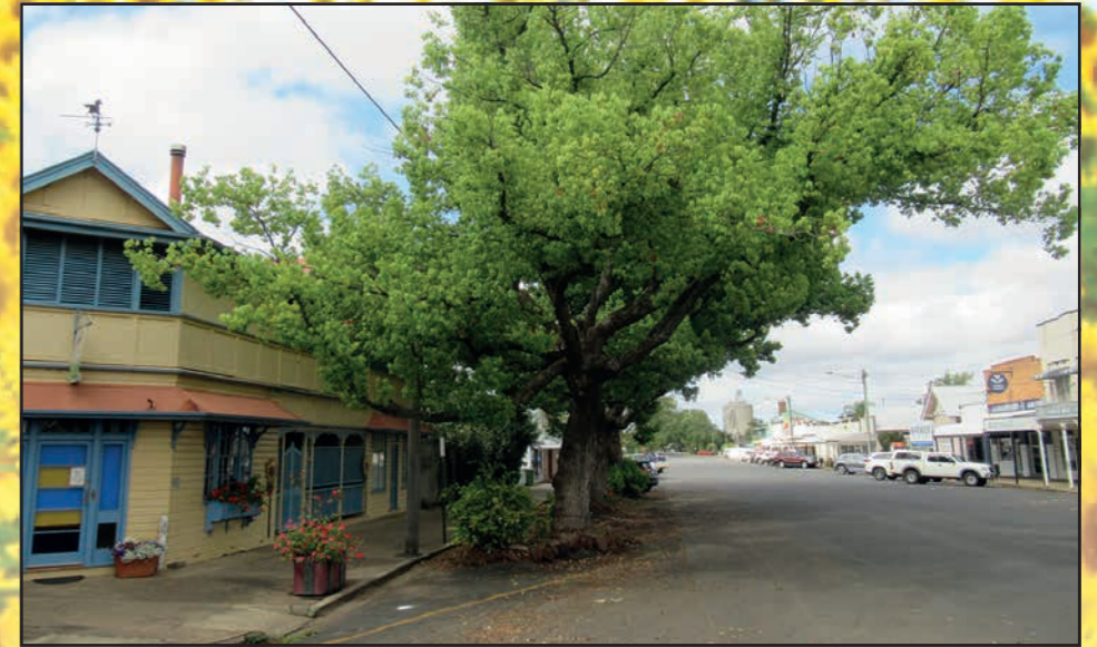
Allora's pretty main street.