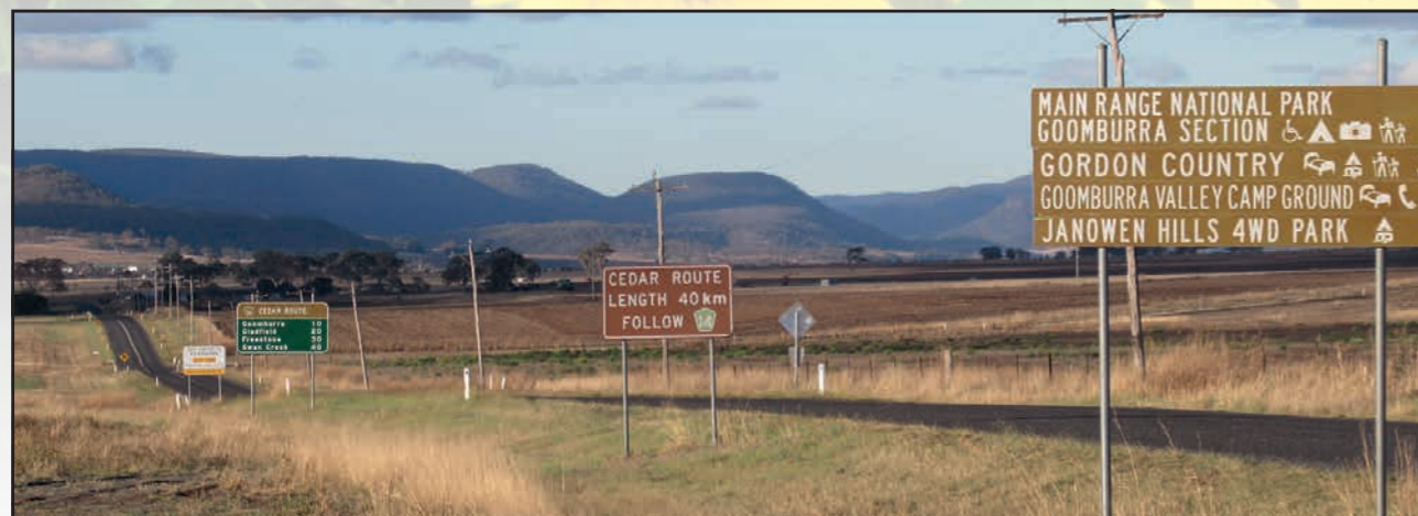
Just south of Allora is the beautiful Goomburra Valley - well worth a drive.