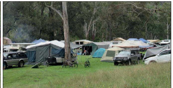
Thousands of visitors made the most of the Easter break and headed up the Valley. Weather was great and the 4 wheel drivers made the most of the off-road muddy conditions.