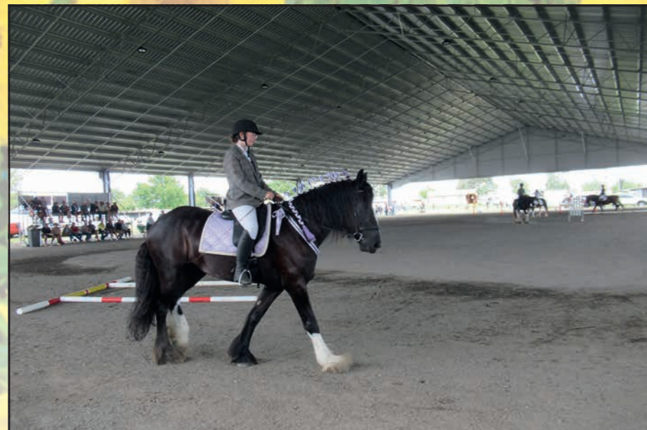
The huge undercover arena at the Allora Showgrounds.