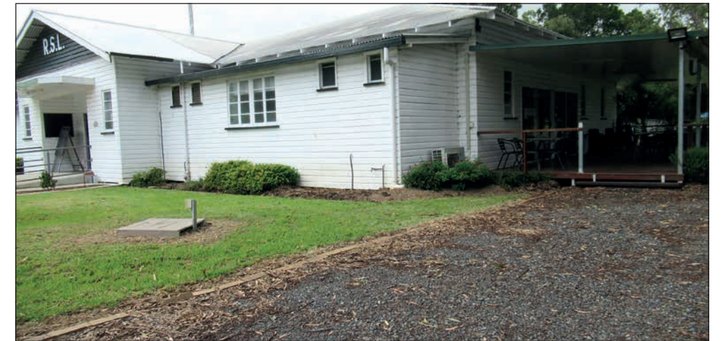
Hall to get a new coat of paint, driveway to be concreted and wheelchair access for side verandah.

The program allows ex-service and not-for-profit organisations that support veterans to apply for grants of up to $50,000 for minor capital works and grants between $50,000 and $250,000 for major capital works.