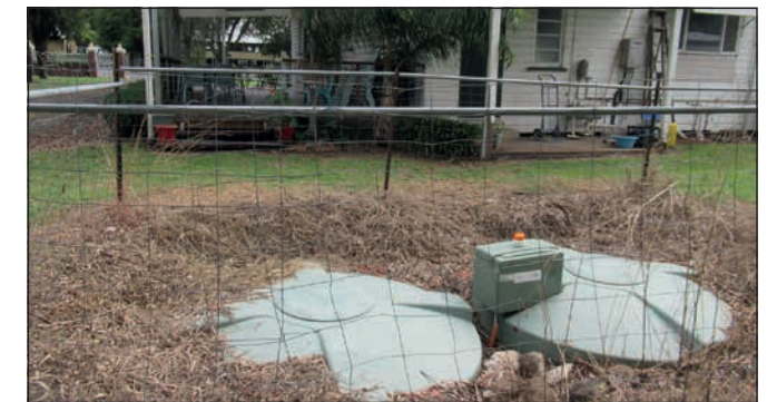
Sullage pit to be finished.

There is still plenty more funding available, with applications now open for another $1.5 million from the 2022 Anzac Day Trust Grants Program and the second round of the Anzac Day Trust COVID-19 Grants Program.