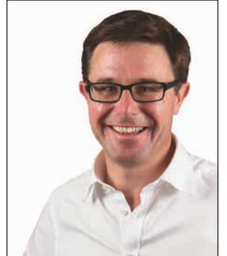
David Littleproud MP.

rural and remote Queensland with thriving communities and vibrant regions and I am fully committed to continuing to get our fair share to ease cost of living pressures, deliver more investment for safer and better roads, and improve access to education and better health support and aged care.