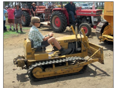
At a previous Heritage Weekend - Every boy's dream.

The only thing changed this year is the date! Still one of the most popular events on the Allora and Queensland Calendar - running this year on Saturday and Sunday 14th and 15th May. Due to Covid restrictions it was decided to postpone the Heritage Weekend from January but it hasn't deterred exhibitors.