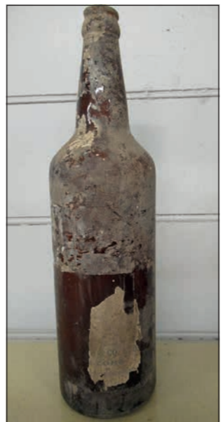
Antique bottles will be for sale at the Fair.

Enquiries to Peter on 0499 372 040 or Dawn on 0412 663 757.