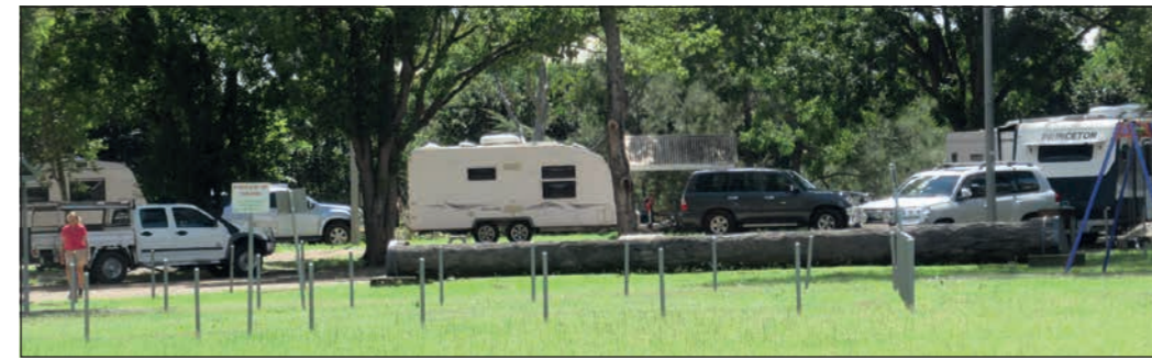
ABOVE: Allora is still welcoming plenty of caravaners and tourists to our town