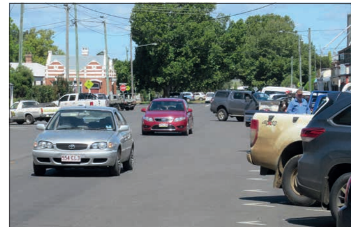
LEFT: A great place to shop and no parking meters here in Allora.

Contrary to a recent interview on the local ABC radio, Allora is still a busy shopping centre for locals and visitors.