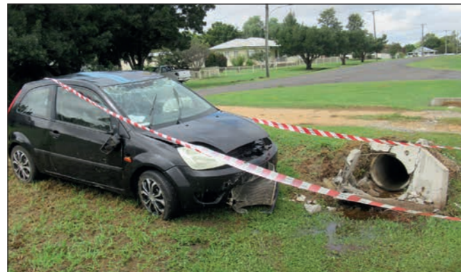
Accident in Warner Street Allora that left car and drain badly damaged.