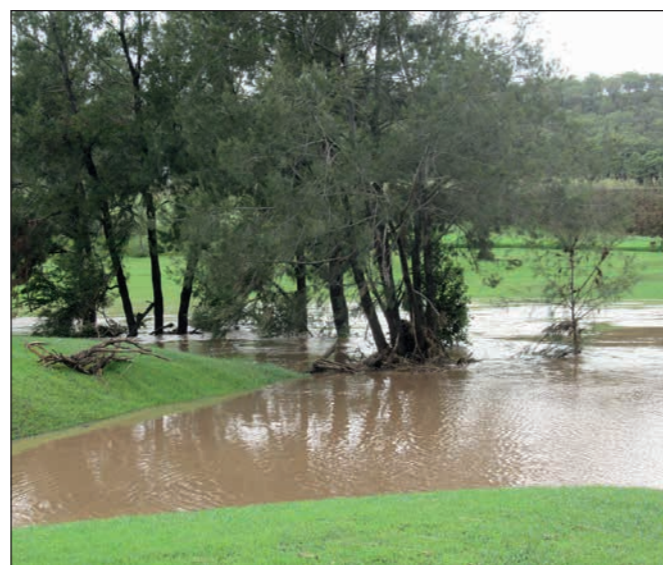
Becoming a familiar sight.