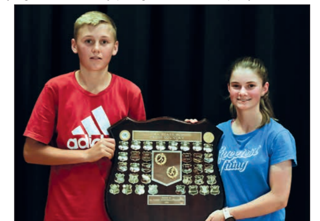
Gwynne House Captains with shield - Denovan and Belinda.