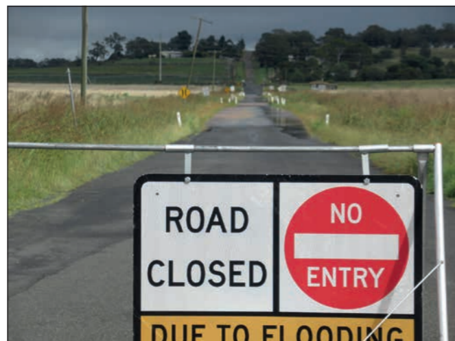
Allora Clifton Road closed on Tuesday.