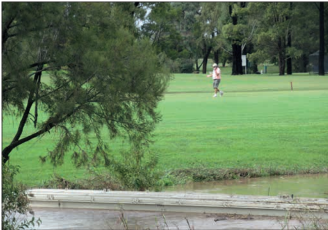
Allora Sports Club's John Ellwood checking out the condition of the Golf Course after the overnight flooding.