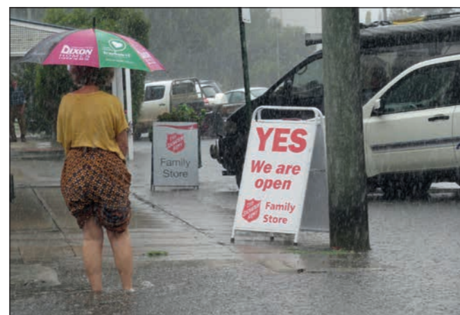
Umbrellas were out yesterday for another downpour in Allora.