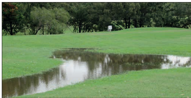
Added obstacle for the golfers.