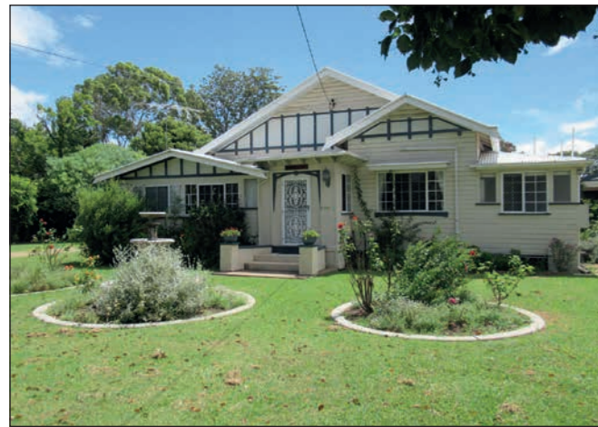
Mirrabooka Guest House (as it is today).