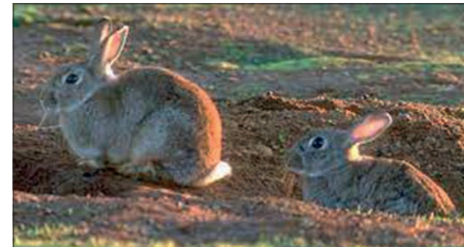
Rabbits considered agricultural pest.

On-ground management of problematic pests and weeds will see a significant boost through an Australian Government investment of $20 million, matched dollar for dollar by state and territory governments to maximise impact and deliver collaborative reduction and prevention activities across the country.